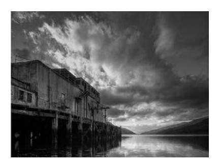
Long Loch station, Scotland

So torpedo testing facilities can be found all around world. Many of these testing stations are abandoned, and have already found new uses, as the Torpedo Art Factory in Alexandria near Washington in USA, or in China, on Quingai Lake in northwest in Quingai province. Many others are around world in almost all costal states which had Navy with torpedoes. Almost all have impressive constructions, they are on nice sea or lakeshore locations, and all will intriguing connected historical technological stories. The possibility of new use for this torpedo facility is a common question as in any industrial heritage revalorisation.