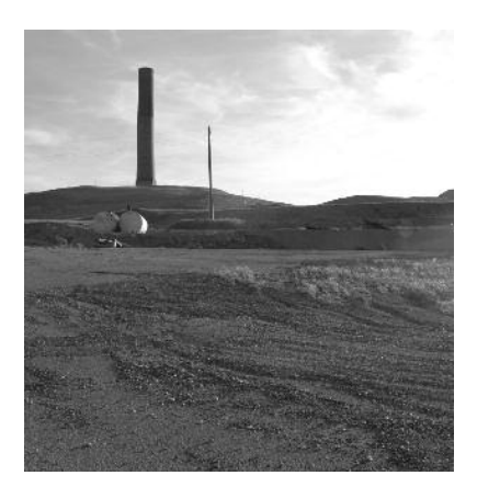
During the 1980s, all structures related to the smelter, except the stack, were demolished during remediation activities, most with little consideration for historic significance. While the stack itself is an imposing and impressive landscape feature, the barren hillside surrounding it belies the level of activity that existed at the site for nearly 80 years.

technological sophistication, or longevity, are the root causes of serious environmental degradation. But neither heritage preservation nor environmental remediation should negate the other—both are key components of strong communities and both carry legal mandates in the United States.