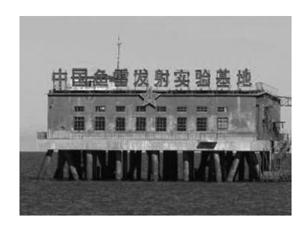
Lake Quinhai, China