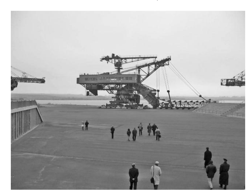
Gräfenhainichen. Event arena Ferropolis with decommissioned excavators as scenery.

The article is based on the author's presentation at the XIV TICCIH Congress and draws on the results of the development and research project "Rehabilitation and Development in Mining Regions" (READY), funded by the EU INTERREG III B programme from 2004 to 2007. Partners from six European countries (Austria, Czech Republic, Germany, Italy, Romania and Slovakia). Basic research in Bad Bleiberg was done by the Karl Franzens University (KFU) Graz, Institute of Geography and Regional