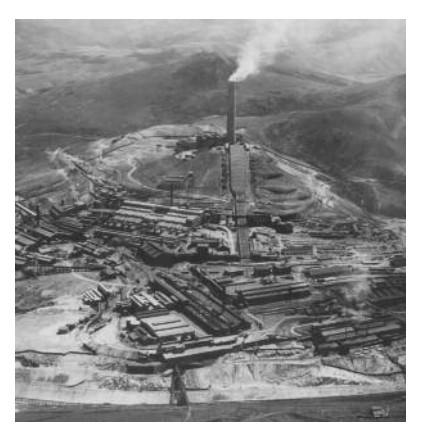
Anaconda Copper Company Washoe Smelter, Anaconda, Montana ca. 1950. For many decades this was the largest and most productive copper smelter in the world, employed thousands of workers, and was responsible for several innovative processes.