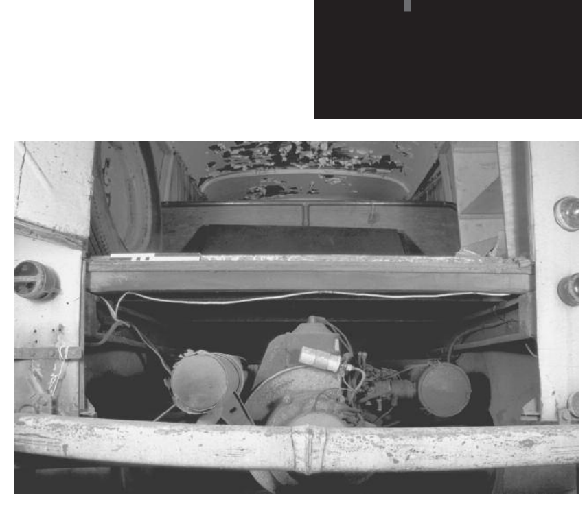
Photo was taken during conservation works. The peeling layers of paintwork at the sealing were stabilised by injecting a solvent-based bonding agent under the flakes, after which they could be reformed using heat and reattached.

extent the romantic traces of decay and neglect which dominated the vehicle's appearance at the outset.