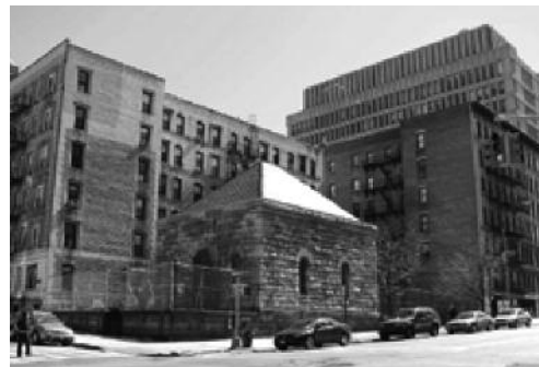
The 119th Street Gatehouse (center, corner of Amsterdam Avenue and 119th Street) was constructed in 1894-95 as part of the Croton Aqueduct system. The one-story rusticated granite building, which is an individually designated NYC landmark, has been vacant since 1990.

The challenges confronting waterworks heritage stewardship and sustainability continue to mount. At this moment, in the United States, monumental, visible, publicly-accessible and above-grade waterworks heritage is privileged in terms of recognition, designation, protection, political support and economic investment over the no-less monumental, but invisible, publicly-inaccessible, and below-grade heritage. There remains a need to expand the public's awareness of the engineering and cultural significance of this heritage. Encouraging a debate about the feasibility of preservation management guidelines that sensitively balance preservation and water management priorities for active waterworks heritage would be instructive. Best practices guidelines, such as the Nizhny Tagil Charter, as well as preservation management guidelines for historic bridges, might be carefully assessed for their feasibility and applicability to waterworks heritage. For decommissioned heritage, procedures need to be established which assist municipalities in surveying out-of-use structures and sites, and facilitating jurisdictional transfer of these structures and sites to new owners bound to preserve character-defining features. Ultimately, all of these ideas underscore one of the Nizhny Tagil Charter's maintenance and conservation goals: that "Continuing to adapt and use industrial buildings avoids wasting energy and contributes to sustainable development."