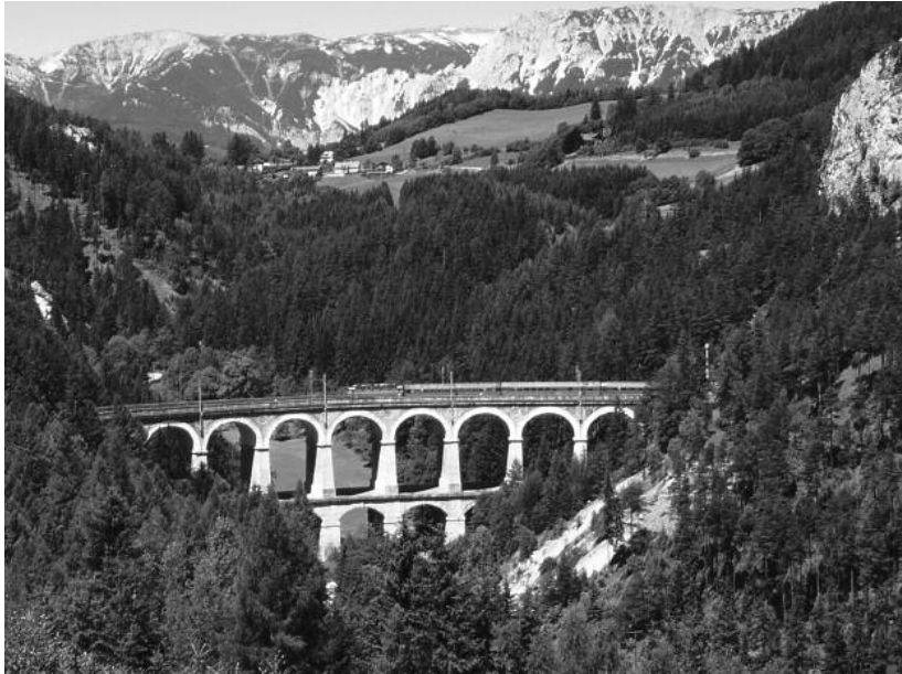
Kalte-Rinne-viaduct at the Semmering-railway.

which is the capital of the province Styria. On the next day the train pass the alpine landscape to bring the travellers the World Heritage region Hallstatt-Dachstein. There, a salt-mine will be visited which has a history of systematic mining of around 3000 years. Then the train ride leads to the Benedictine monastery of Admont; this monastery contains an extensive and impressive library. Back on the train, the route passes through the rough alpine valley named Gesäuse which is also a national park. The next World Heritage site is the valley of Wachau, a cultural landscape dominated by the Danube river and the wine-growing areas. Finally the tour leads back to Vienna where there are two World Heritage sites – the historic centre and the palace of Schönbrunn.