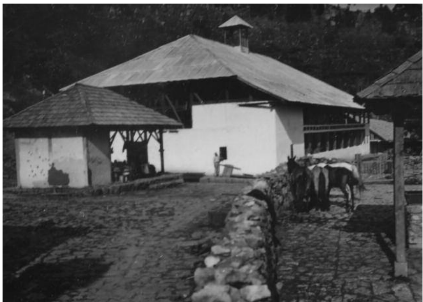
Coffee processing plant, late 19th century, Pandi, Cundinamarca, Colombia.

Companies such as Correa and Heilborn with cattle breeding, Henriquez and Mathine with tobacco, Senior, Desola and Co. with cotton,