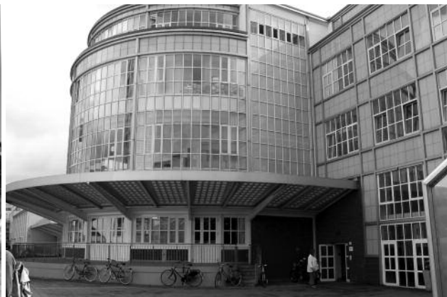
The 4711 building in Cologne, Germany