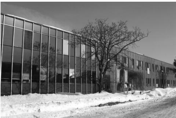
The CIBA building in Dorval, Quebec, Canada

The search for re-use options alone may not suffice. Differing interpretations of protection laws and varying selection criteria for heritage sites are only two examples among many others which need to be analyzed when searching for the reasons why so many important industrial sites are disappearing. Many other factors have to be considered in such an analysis; some are practical ones, such as taxation laws and zoning regulations; some are less easy to grasp, such as value systems shaped by history and discrete political agendas.