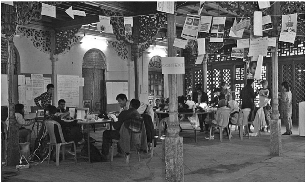
The workshop was held in an abandoned Mughal era palace highlighting how neglect of the factory is linked to neglect of the precinct and its rich heritage. The palace with filigree cast iron columns and stained glass windows was renovated and converted into a studio space for the workshop.

The issues and challenges of sustainable development, environmental responsibility and safeguarding the rights of the vulnerable remain as important today as 25 years ago; underscoring our belief that understanding and protecting the past is an important investment for our future.