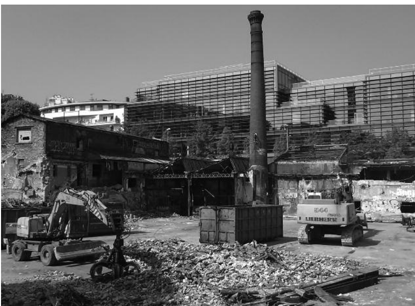
The death sentence was carried out on the old Gaupillat factory.