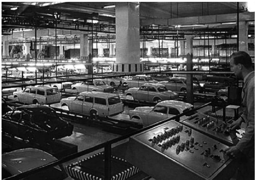
Sublime control: Mass-producing Volvos in Torslanda, 1964

In both Turin and Gothenburg, the relationship between city and company was characterized by symbiosis: the municipality provided the necessary infrastructure and workforce, the company provided stability and wealth. It also added the image of a modern city. The relationship was, however, built on expansion. When expansion was no longer possible, the relationship started to crack. Decades of crisis in the automotive industry forced the two cities to reconsider their identities as urban centres. In Turin, where the character of one-company town had been most successfully accomplished, the difficulties were harder to deal with. The expression dopo Fiat (after Fiat) was the headline of an ongoing debate, while in Gothenburg similar processes meant painful changes for the many people depending on the city's most important industry, leading to a search for new identities and sources of work and living.