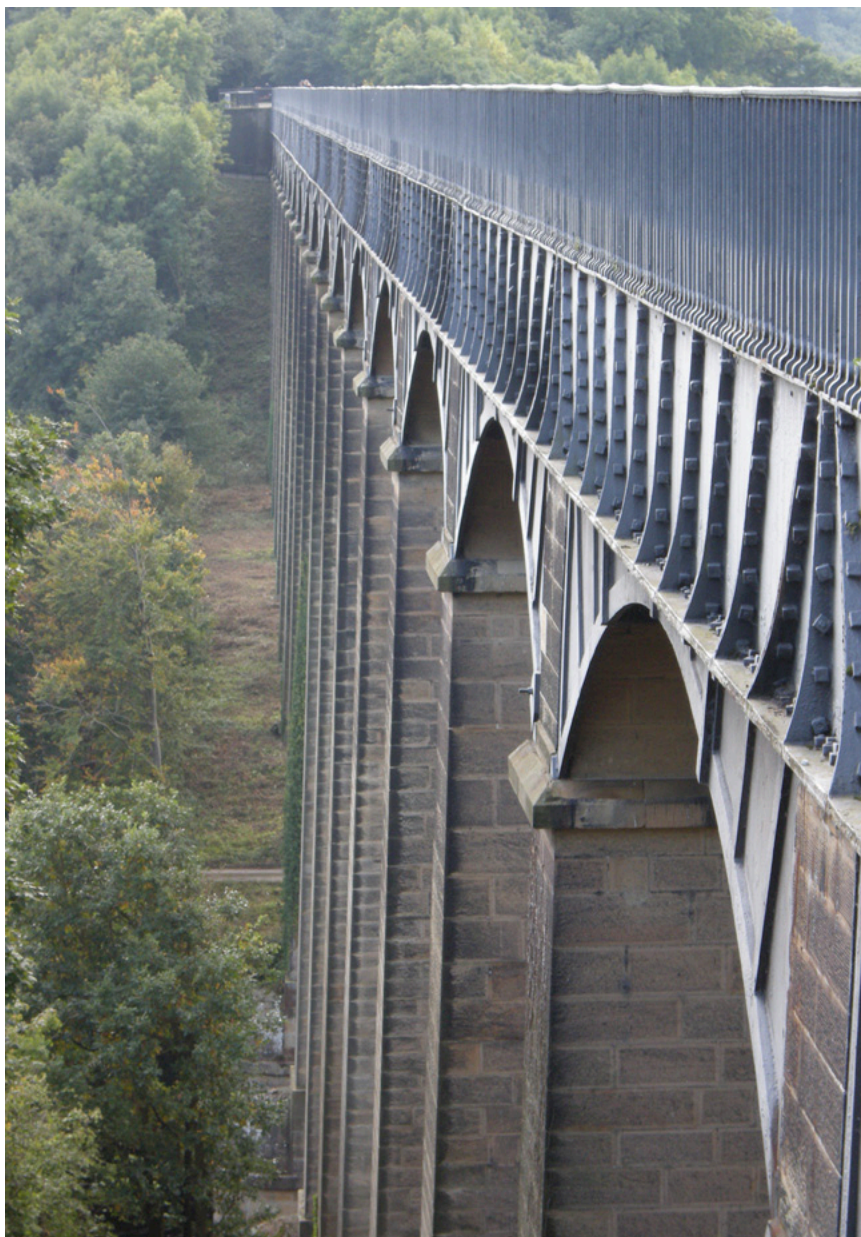
The greatest heritage asset of the CRT is Pontcysyllte Aqueduct; restored by BWB for the bicentenary of its completion in 1805. It was designed by Thomas Telford and William Jessop and consists of a cast-iron trough 307m long carrying the Llangollen Canal 38m above the River Dee. Inscribed on the World Heritage List in 2009.

In June British Waterways will cease to exist and its assets, currently valued at £680 million, and including all staff, will be transferred to the new Canal and River Trust (CRT). The CRT will have responsibility for all inland waterways and a number of rivers in England and Wales. In Scotland, the waterways – most notably the Forth & Clyde and Caledonian canals – will remain in the ownership of the Scottish Government. Building membership support, in co-operation with the numerous membership-based waterways groups, will be an important aspect of the CRT's work. Currently, the National Trust has a membership of over four million and English Heritage's membership exceeds 850,000. In both cases membership income forms a substantial part of their revenue income. The current revenue turnover of BW is £170 million and a contract with Government will ensure that the current public sector contribution to the CRT is guaranteed and inflation-protected over the first fifteen years of the new trust's life.