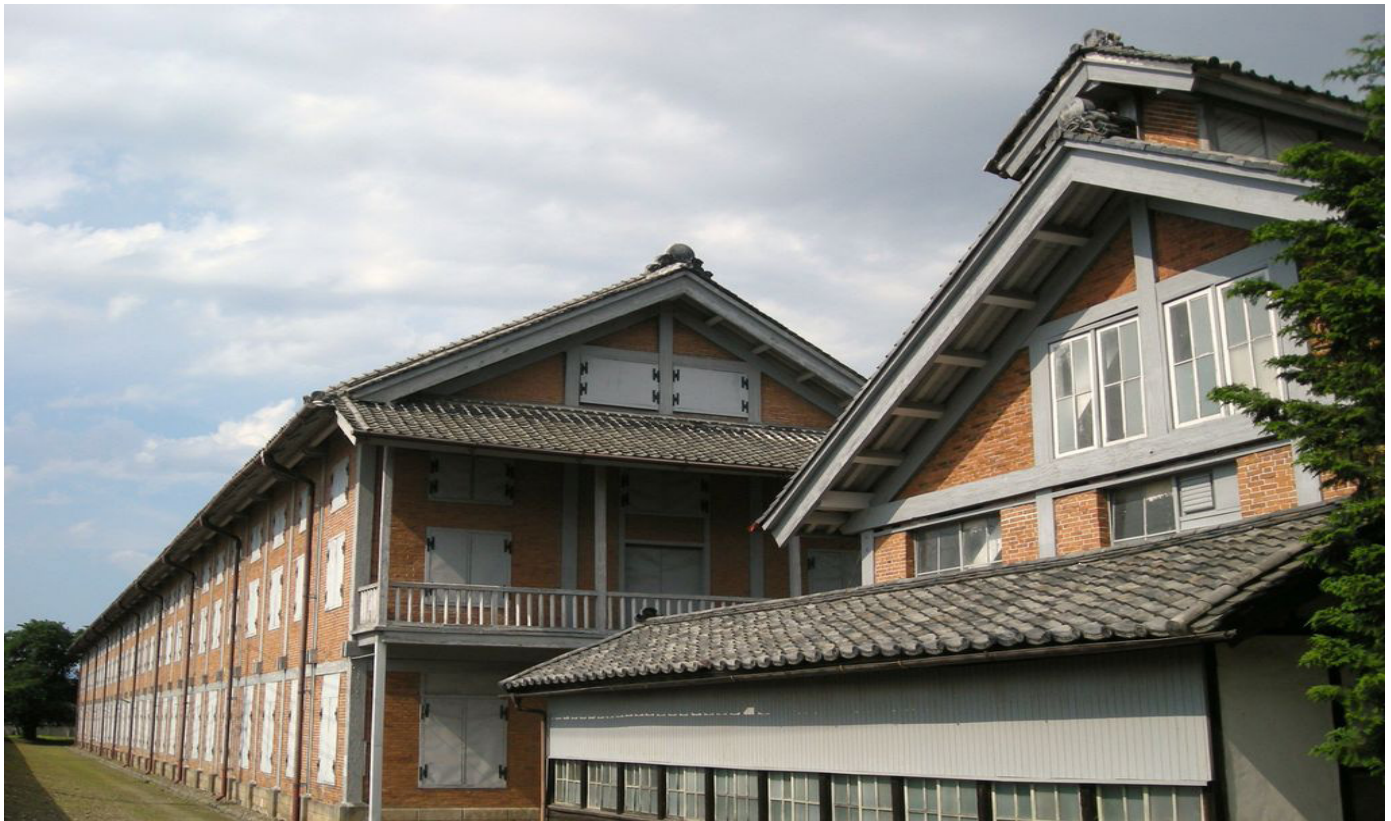
Tomoika silk mill. The Tajima-Yahei house is the prototype for modern sericultural farmhouses

Arafune fu-ketsu is the largest scale cold storage for silkworm eggs. Fu-ketsu was a cold storage facility for silkworm eggs using cold air from gaps between rocks. With a use of such fu-ketsu, multiple rearing of silkworm was enabled in the late 19th century. Arafune Fu-ketsu with its largest storage capacity, had business with clients from all Japan and even from the Korean Peninsula.