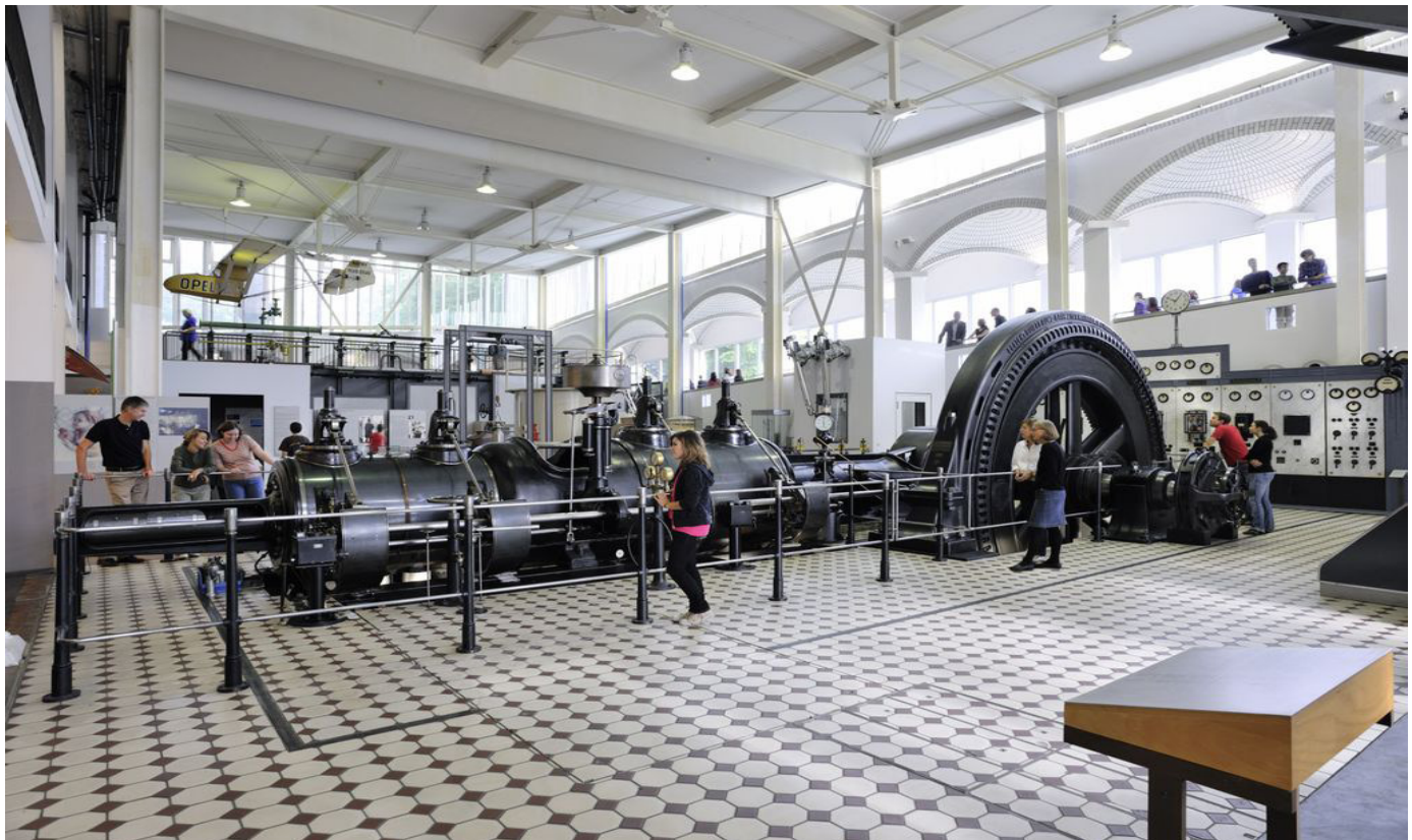
TECHNOSEUM's 500 hp uniflow steam engine built in 1908 by Maschinenfabrik, Esslingen

As this is quite a comprehensive task, the department of collections at the TECHNOSEUM also pursues a more detailed and differentiated collecting strategy based on the existing collection. This strategy, of course, aims to fill gaps in the existing collection and to expand it in areas in which the museum wishes to specialise.