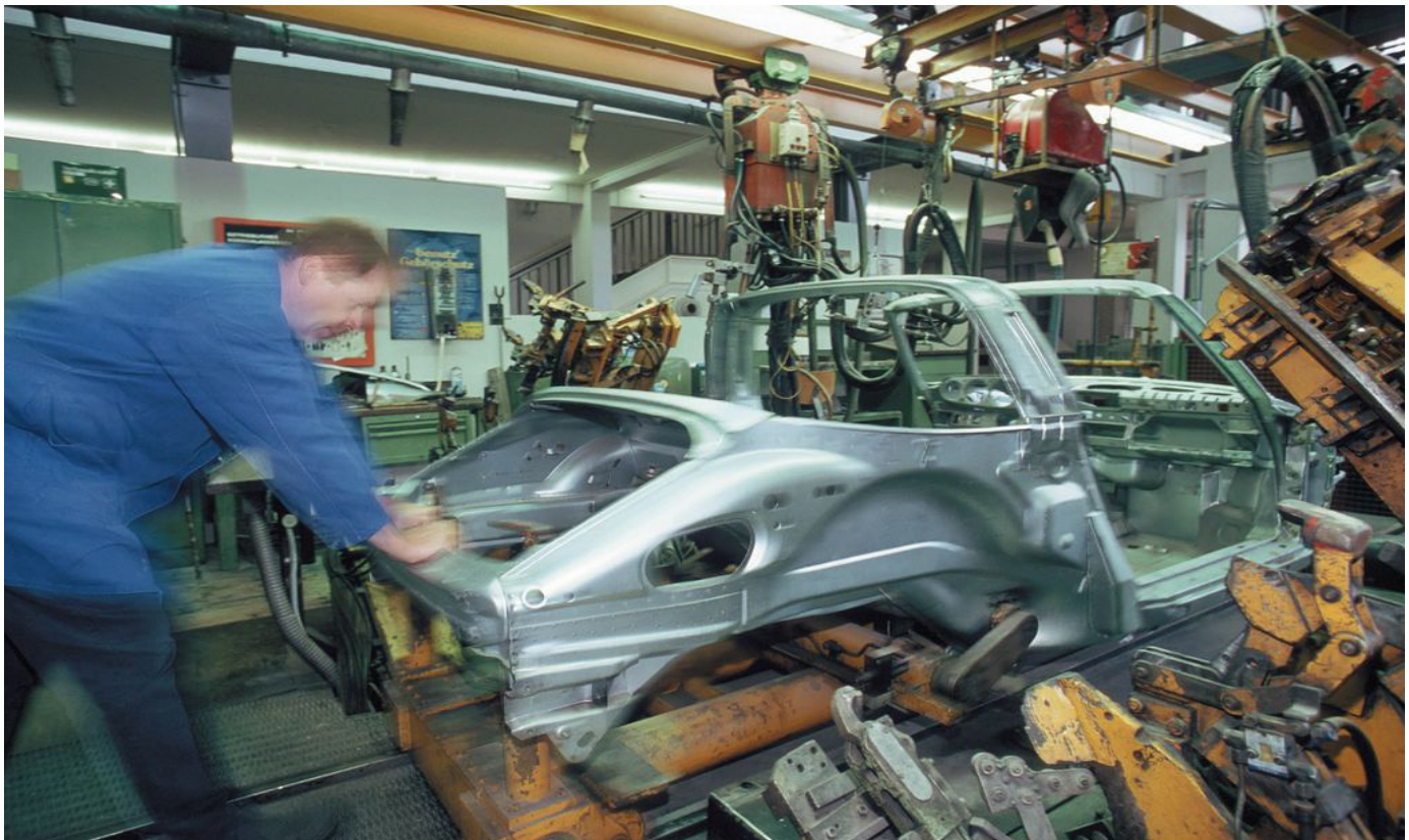
A demonstration of the Porsche car body construction line.

Another aspect in the permanent exhibition additionally reflects the TECHNOSEUM's role in conserving industrial heritage. The collection of vehicles ranges from late carriages, early cars, motorcycles and agricultural engines to almost contemporary vehicles. The rare Lanz Bulldog HL and HR 2 models, which resolved dependency upon steam engines, are an extraordinary example of these assembled objects. Additionally, cars such the fully restored and functioning Mercedes 170 V dating from the middle of the 20th century give insights into the early development of car production. These objects are central to the collections as the car industry is still one of the major local industries. Carl Benz developed his combustion engine car in Mannheim and his wife Bertha drove it on its first major expedition. Daimler offers to build reproductions to this day.