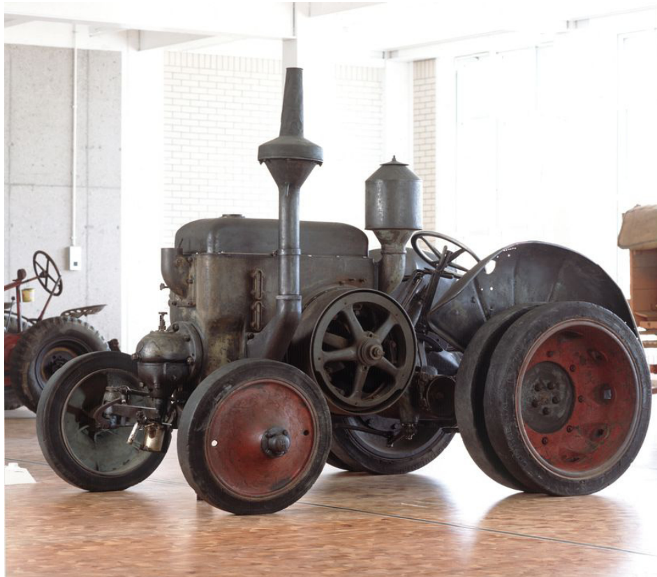
The Lanz Bulldog HR2 tractor

TECHNOSEUM Landesmuseum für Technik und Arbeit in Mannheim, Ger