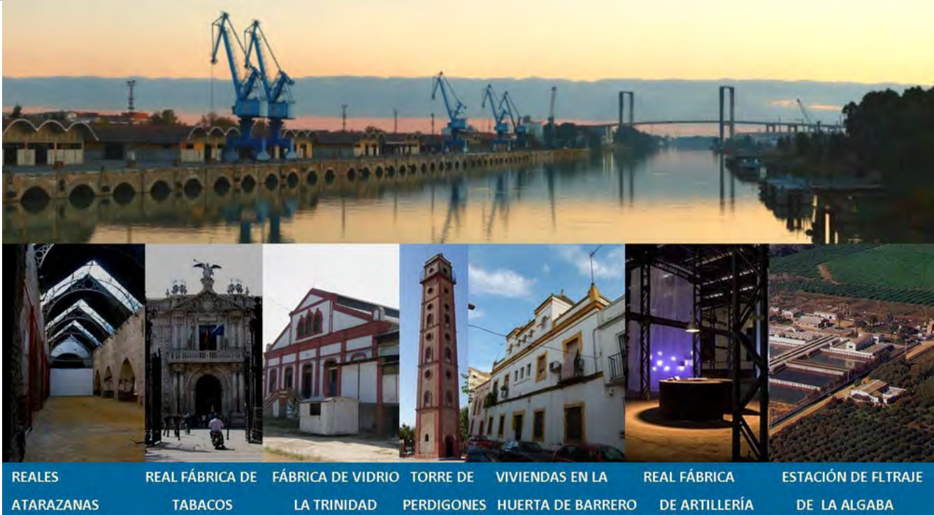
Images from Seville industrial heritage include the old port, various royal industrial initiatives, and (centre) the shot tower.