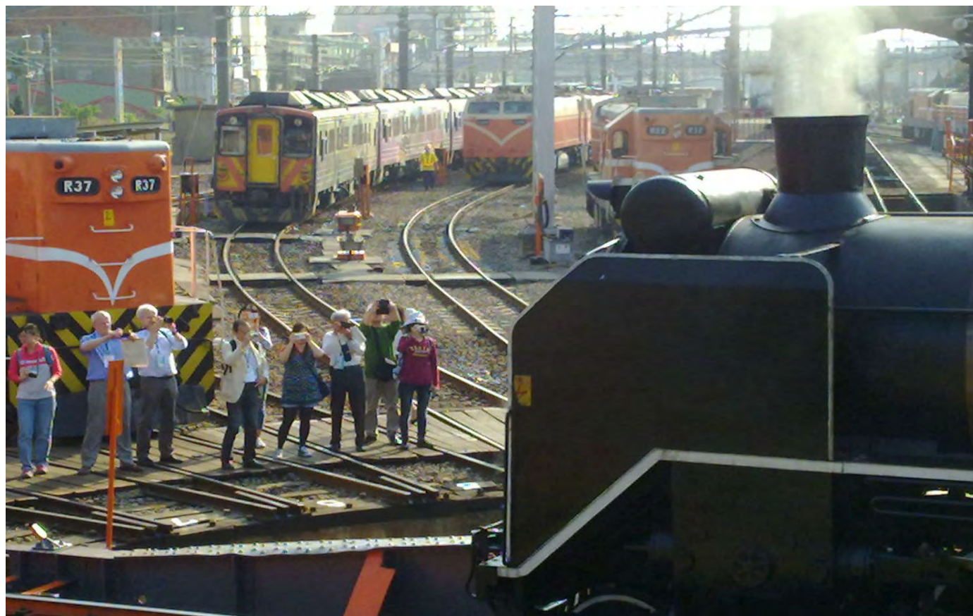
Colonial heritage, in this case a Japanese Mitsubishi DT 668, steaming across the round table at the 1922 Changhua Railway Workshop, designated a historic site in 2001.

The final wording of the text is being prepared and the document will be published on the TICCIH website and elsewhere.