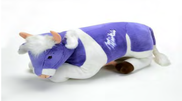
“Milka-Kuh” – the purple cow has represented Milka chocolate since 1972. In the mid-90s, 30% of Bavarian children tested drew cows purple.

The actual objects of the merchandising industry also fulfil more tasks than they are supposed to as – beyond selling industrially-produced goods – they blend object, product, quality and standard of living into one chain of association. A mass of these chains of associations forms a web of commercial knowledge and culture which has become an integral part of our general perception of the world: advertisement is everywhere, brands flood our senses. “Vorsprung durch Technik”, for instance, has become a global cipher for high-tech automobiles from the south of Germany. Everyone knows it, everyone understands it and everyone uses it.