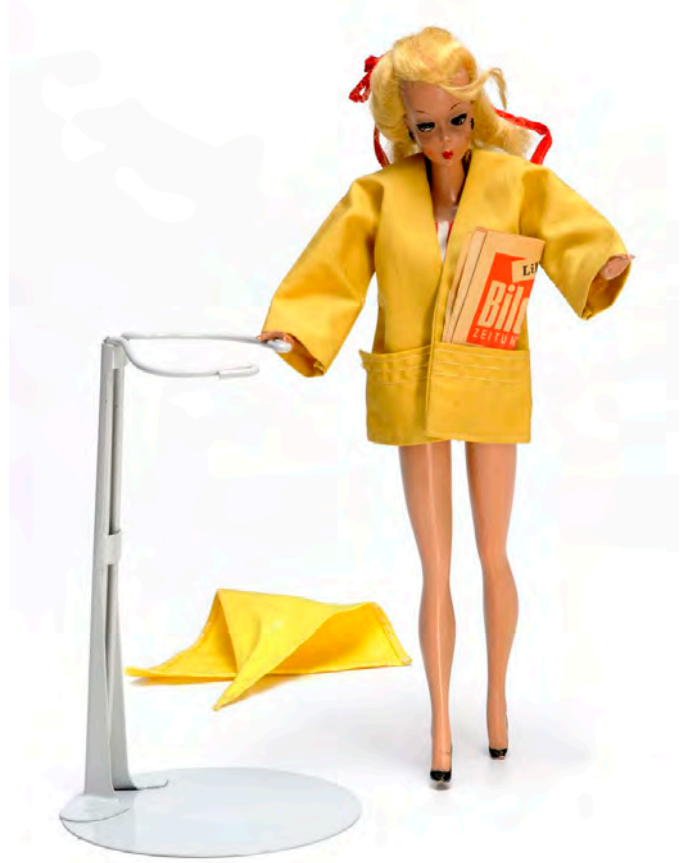
“The “Bild-Lilli” was produced by Hausser/Elastolin from the mid-1950s and eventually used as a model for Mattel’s “Barbie” in 1958.

The objects referred to will form the context of future exhibitions at the TECHNOSEUM and go on to be displayed in their entirety in an exhibition on commercial culture scheduled for 2016.