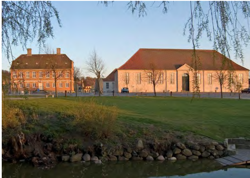
The gun foundry at Frederiksværk (1760)

The museum is fully staffed, and all staff have an in-depth knowledge of industrial history and the connections to other Danish industrial museums. The idea is to combine modern media with a town that is so rich in the remains of the last 250 years of industrial history: exceptional industrial buildings, workers' dwellings and the canal that was the basis for establishing the factory village of Frederiksværk. As part of the project to tie together the museum units and the physical town, we are currently planning the development of activities to attract children and adults alike, and the development of the powder works area just outside the Powder Works Museum. The area consists of a large number of buildings dating from the 1760s to the 1950s all originally belonging to the powder works. It is reminiscent of the well-known Swedish 'bruks-environments', rarely seen in Denmark. In five years we hope to have achieved these goals and to be known as a modern and lively museum, which has created an environment that makes it worthwhile spending a whole day exploring the industrial past of Frederiksværk and its surroundings. The region is one of the most beautiful in Denmark, and it has a very large area with summer dwellings that attracts thousands of guests and tourists every summer.