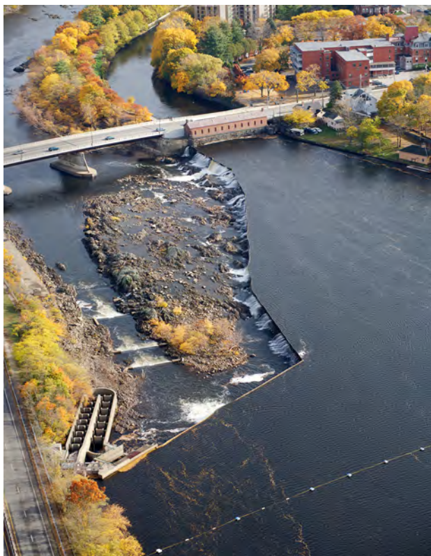
The Pawtucket Dam dam is in many ways the centerpiece of the historic industrial complex at Lowell as well as a key to the interpretive scheme in the National Park.

In 2010, Enel North America, parent company of Boott Hydropower, Inc., the operator of the hydroelectric power station, proposed to replace the historic flashboard system with a pneumatic crest-gate system, consisting of a concrete cap on the dam, topped with hinged steel panels to be raised and lowered by inflatable rubber bladders on the downstream side, beneath the panels, and a compressor house to be built onshore adjacent to the dam. In 2011, with the agreement of the TICCIH Board, I entered a letter of opinion in the hearing process on behalf of TICCIH, opposing the proposed undertaking on the grounds that it would "have a profound adverse effect on the integrity of the historic resources of the Lowell National Historical Park."