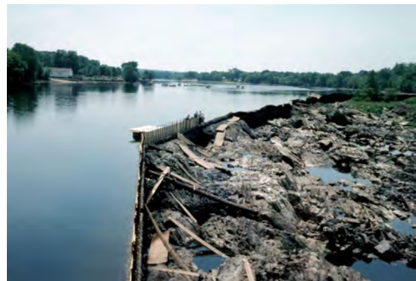
The flashboards on Pawtucket Dam being repaired or replaced in 1975.

The Advisory Council issued a strongly worded set of findings and recommendations on February 22, including the explicit recommendation that FERC "not approve the Project to replace the existing flashboard system with a pneumatic crest gate system." Other portions of the comments include guidance about carrying forward a consulting process that pays stronger attention to the historical values of this landscape. While the Advisory Council is, by definition, an advisory body, we feel that this set of findings is a significant step in the right direction toward assuring the protection of this important piece of America's industrial heritage.