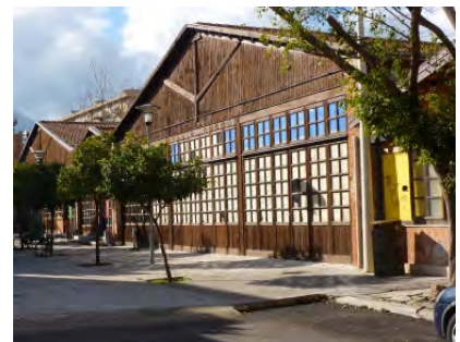
The former seaplane hangar Palermo, Sicily, now the ZISA Academy of Fine Arts.