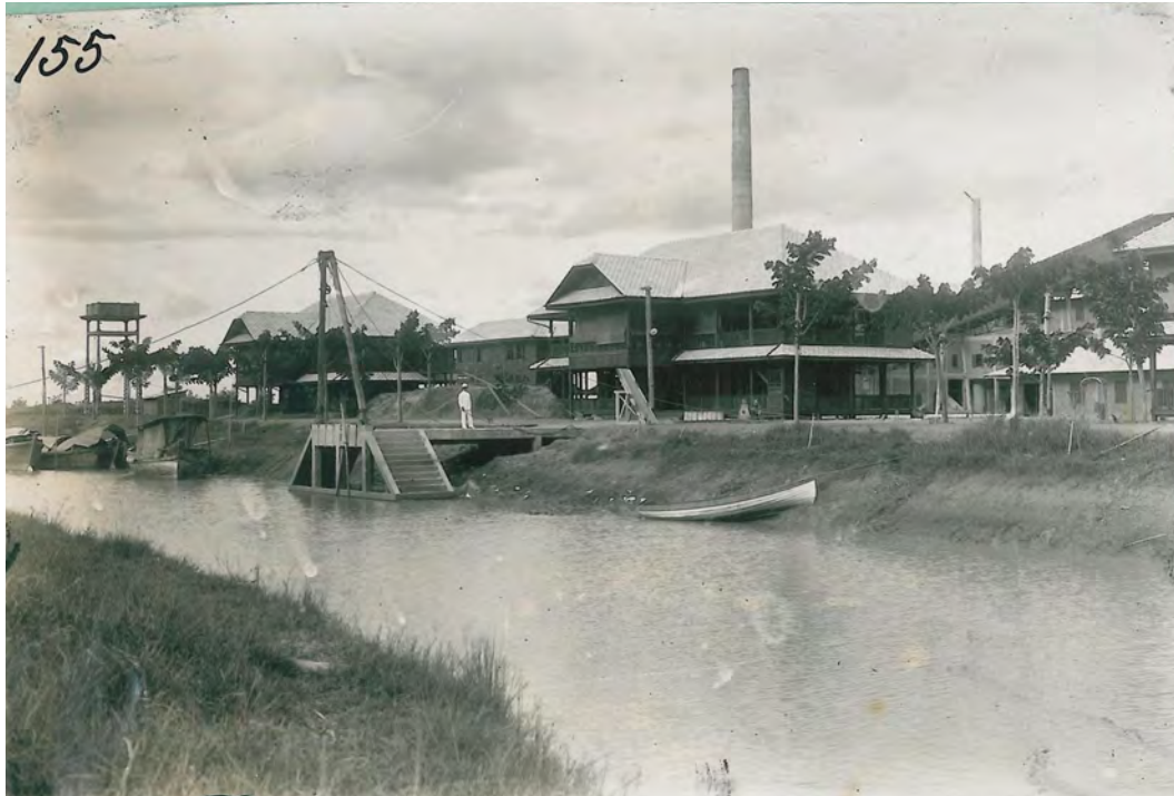
Living quarters for the Danish engineers and managers of the Siam Cement Co. plant in Bangsue in 1916. The production facilities can be glimpsed in the background.