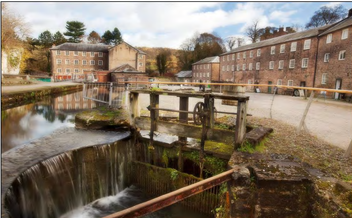
The mills and water system at Cromford Mill.