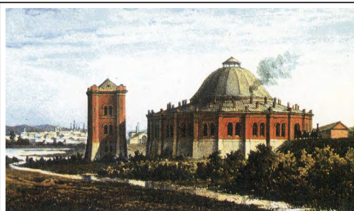
A drawing by architect Rudolph Zhelyazevich of the first railway engine shed in Moscow. It belonged to the former railway to St Petersburg. Of ten such depots only one survives, the “Nikolayevsky” circular depot in Moscow. See Worldwide for details.