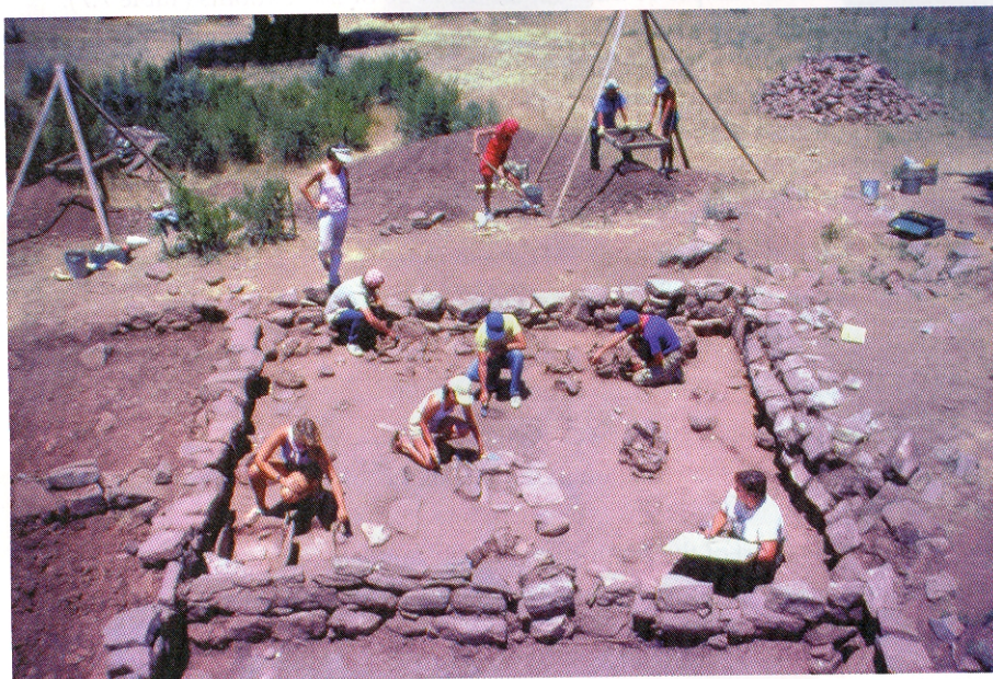
Fig. 7.34 A room at Grasshopper Pueblo in the course of excavation by the University of Arizona field school.