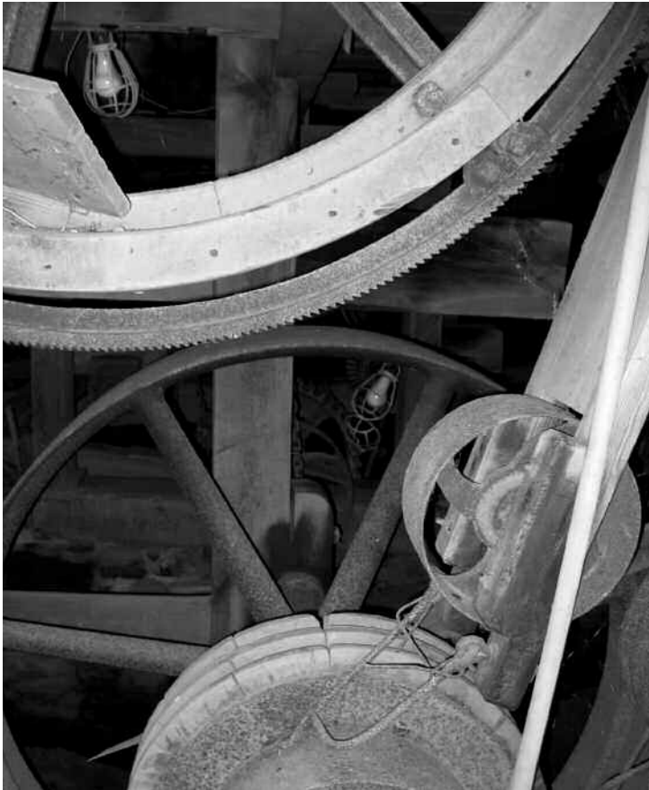
The MacDonald/Klines Sawmill is an amazing example of a water powered mill with many elements of its water powered machinery still in place.

Buckingham of the Green Brook Township Historical Society to this gem of a rural industrial resource. This timber frame “up and down” sawmill is in a remarkable state of preservation and is truly unique.