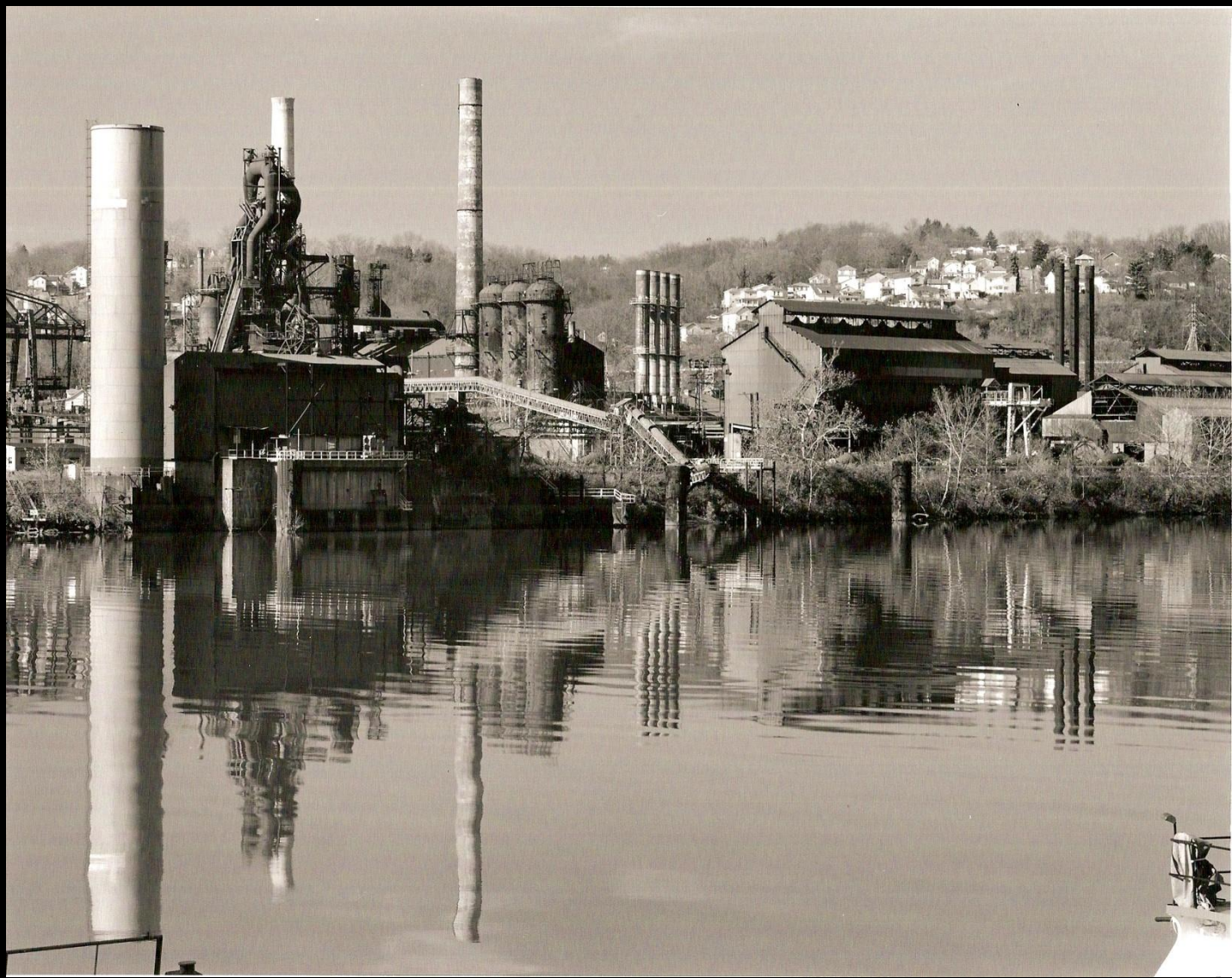
View, looking west, across Ohio River, toward remnants of former Carnegie Steel, and later, Wheeling Steel hot mill at Mingo Junction. Nov., 2012