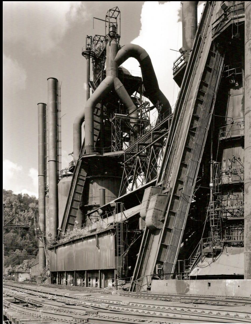
View, looking west, on trestle, showing east blast furnace, casting house, skip car track on east blast furnace. Steubenville, OH, Oct., 2012