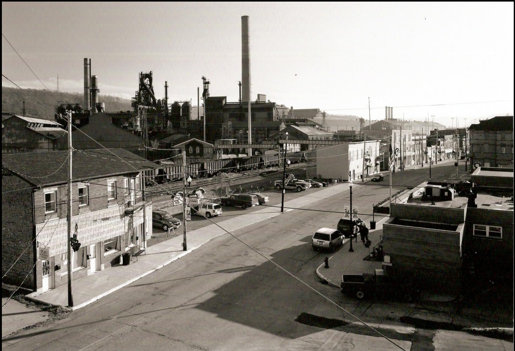
View, looking SE, showing Commercial Avenue, Mingo Junction, with former Wheeling Steel mill in background. Nov., 2012