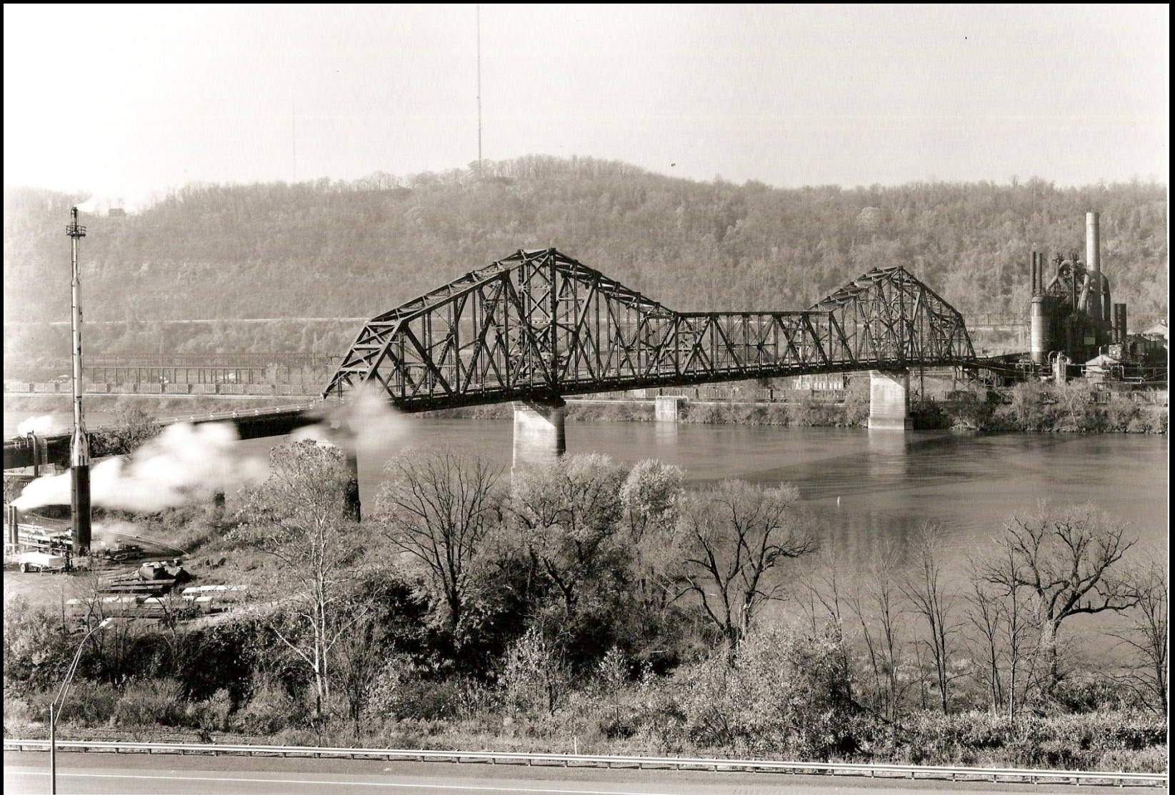
View from West Virginia, looking west, showing W&LE RR bridge across Ohio River, linking coke plant in Follansbee with blast furnaces in Steubenville. Nov., 2012