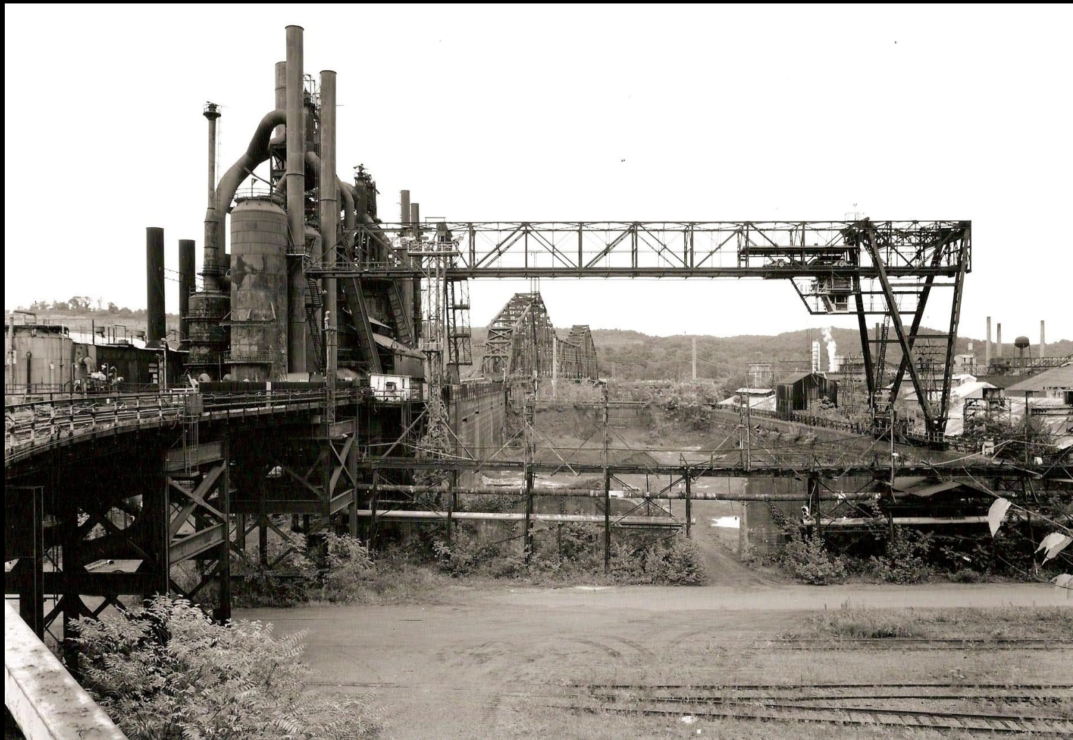
Blast furnaces, ore yard, and transfer crane, from W&LE RR trestle. Steubenville, OH Oct., 2012