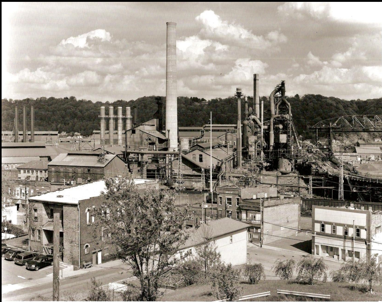
View from bluff, looking west, showing south end of Commercial Ave. business district with mill in background. Mingo Junction, OH April, 2012