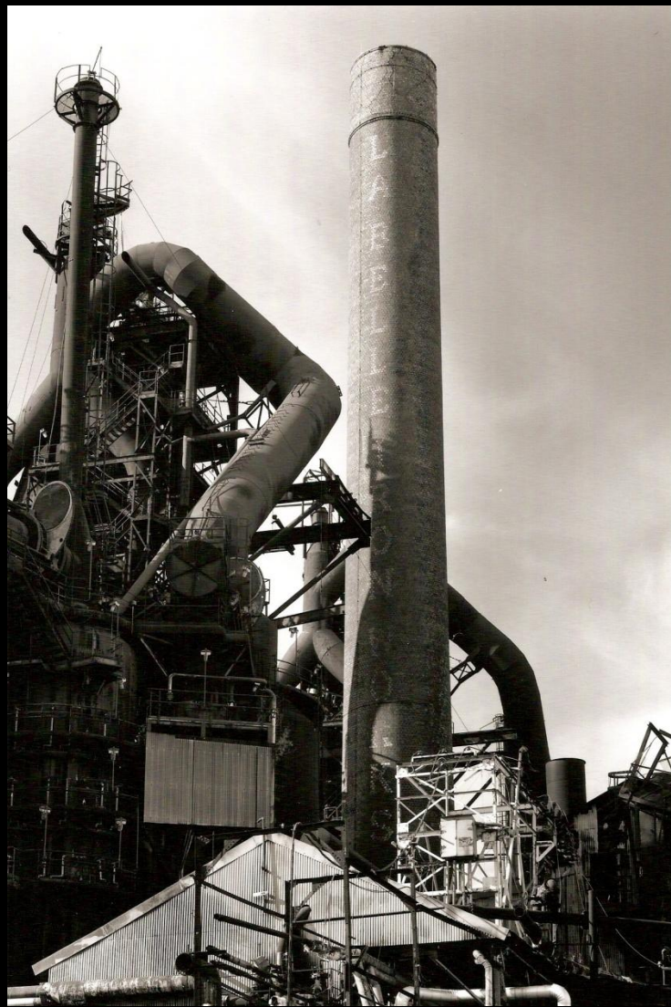
Wheeling steel, LaBelle Ironworks, blast furnace and stack. Steubenville, OH, Oct., 2012