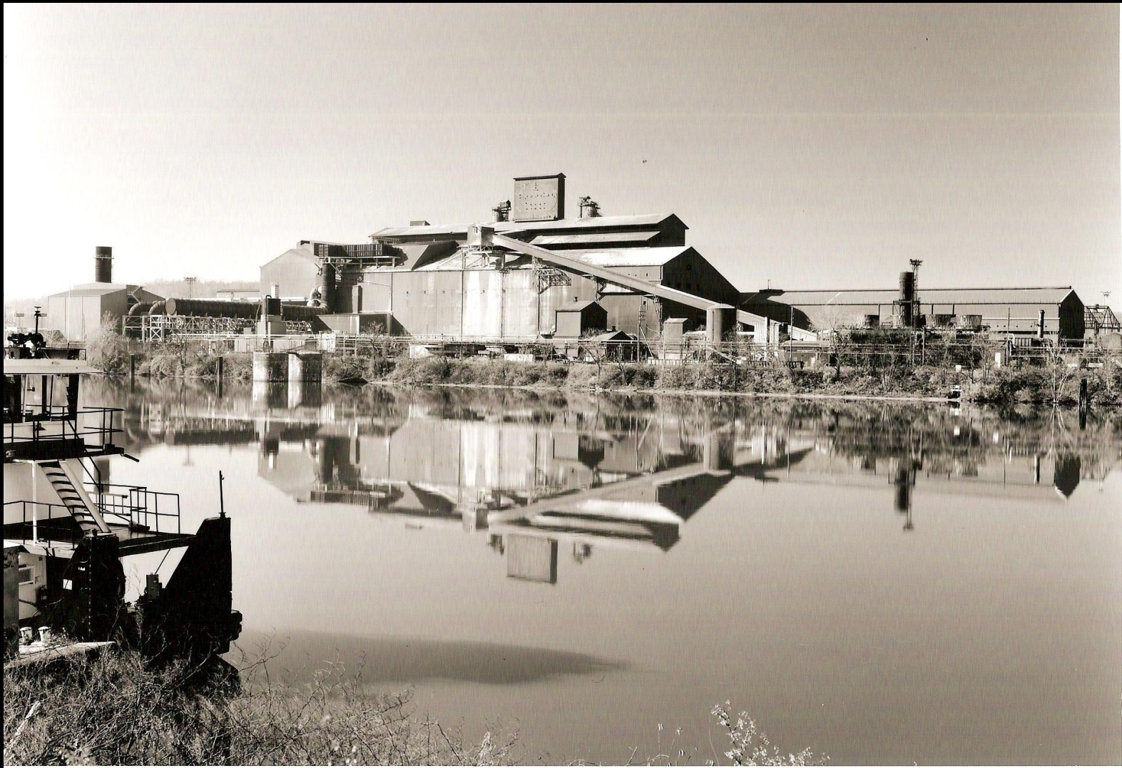
View, looking west, across the Ohio River, showing the electric arc furnace and basic oxygen furnace, continuous caster, at Mingo Junction. Nov., 2012