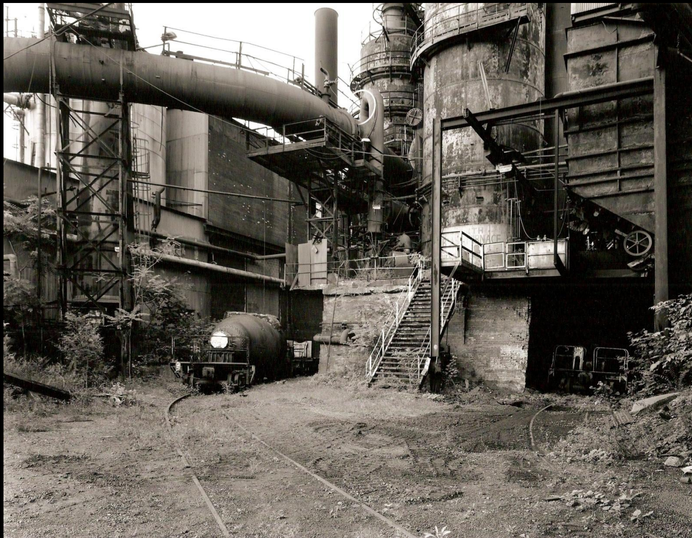
West side of blast furnace complex