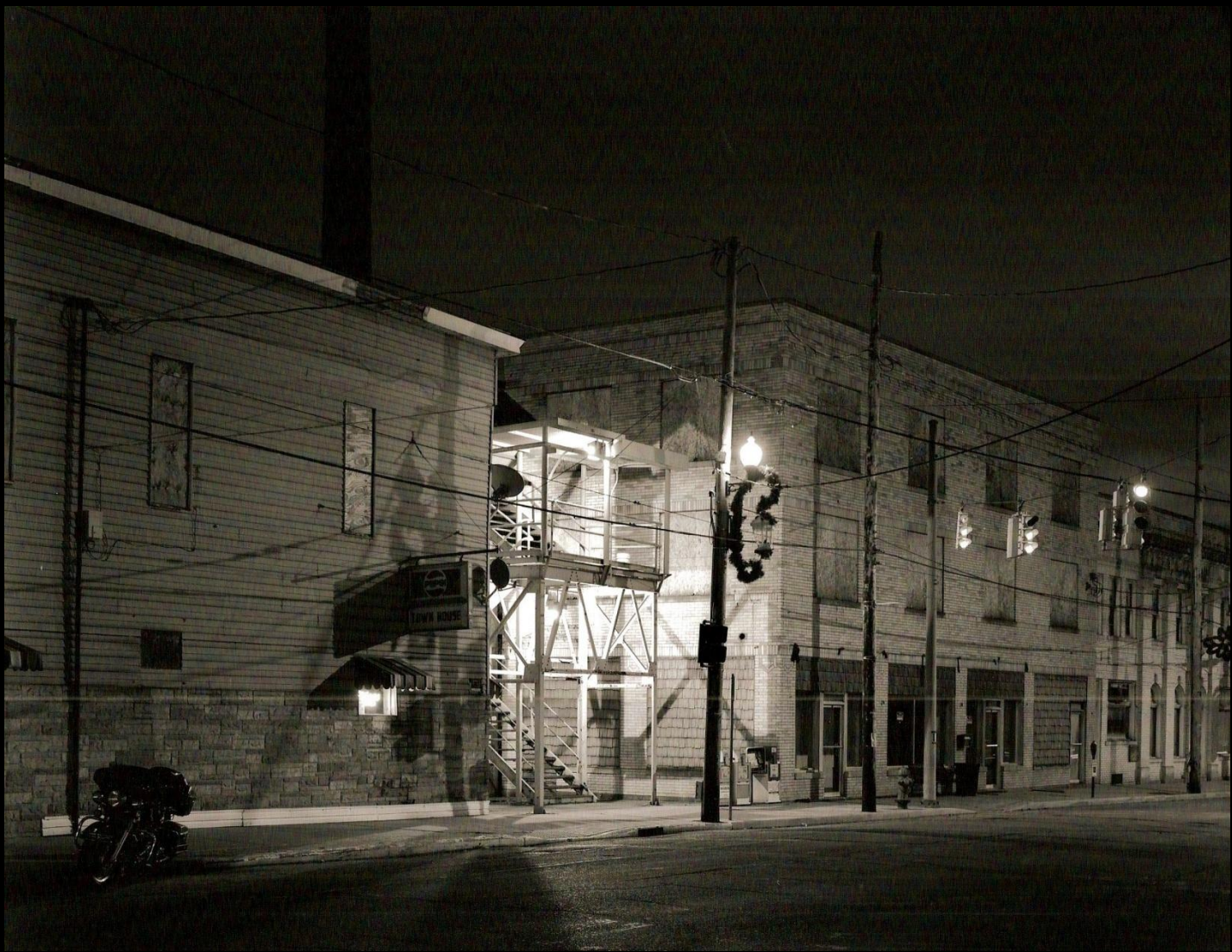
Worker entrance on Commercial Ave. leading to footbridge into mill. Mingo Junction, OH, Nov., 2012