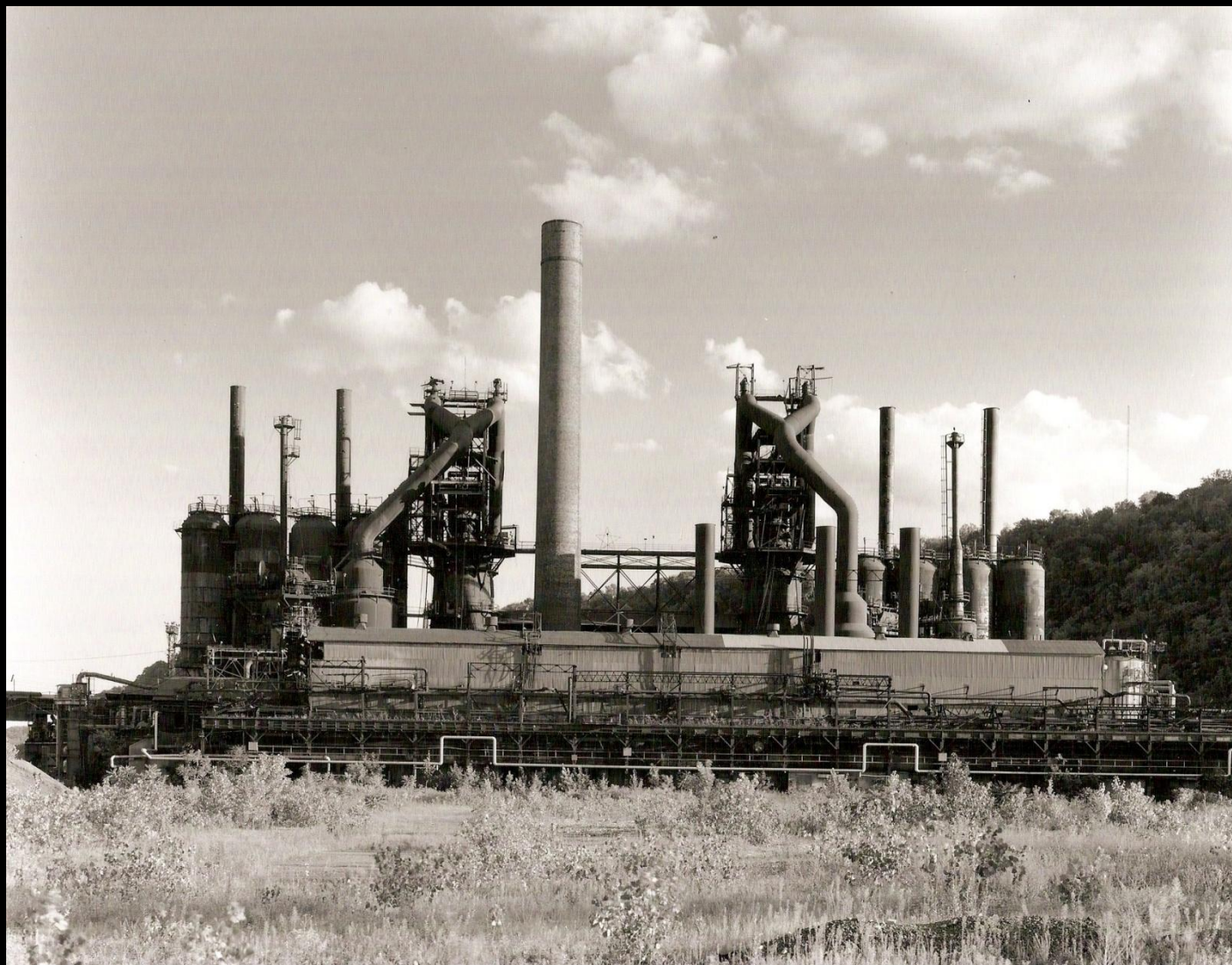
Wheeling Steel, LaBelle Ironworks, blast furnaces and steam plant. Steubenville, OH, July, 2012