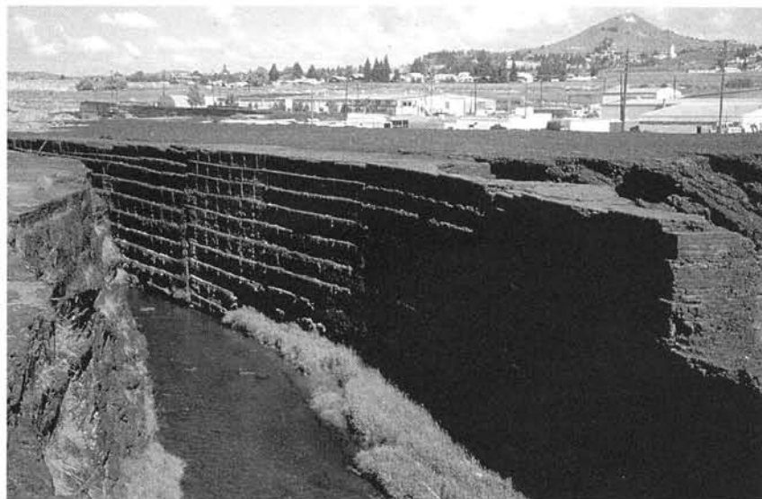
Figure 6. The black slag canyon carrying Silver Bow Creek through the grounds of the Butte Reduction Works is one of the few surviving physical features of that early-20th-century metallurgical facility. Only recently have scholars learned that the slag walls were not merely a novel means of discharging tailings but actually were meant to manage tailings discharged from the plant in the early 1900s.