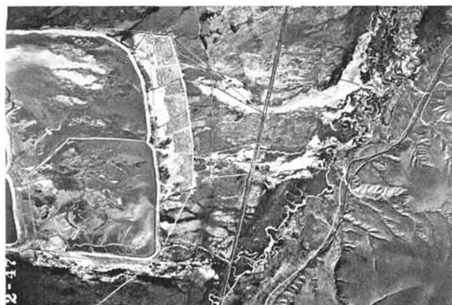
Figure 7. Many sources of tailings flowed into the Clark Fork River, which ran through the Grant Kohrs Ranch. This 1947 aerial photograph shows Silver Bow Creek, a tributary of the Clark Fork, flowing north from the bottom center toward the upper right. The Grant Kohrs Ranch is several miles downstream (north). The features filling the left third of the photo are a portion of the Anaconda Company's Opportunity ponds tailings impoundment. The light features extending across the photo from the Opportunity ponds toward Silver Bow Creek are deposits of tailings that escaped the impoundments and flowed toward the creek.

As the Grant Kohrs Ranch is currently interpreted, and the NPS is generally doing a marvelous job, we learn how cattlemen struggled with the elements in the harsh environment of the Northern Rockies and within a changing national economy to build an industry that still forms many Americans' pictures of what the West is. But the historical reality is that those same cattlemen had to struggle against another facet of the environment: the mining industry, which had a different vision of how the Clark Fork drainage ought to be used. Their conflict led into court around 1905, when the Deer Lodge Valley farmers, complaining of damage to their property caused by smoke and tailings, filed several suits in federal court against the Anaconda Company. 19 One of those cases, Fred J. Bliss v. The Washoe Copper Company and the Anaconda Copper Mining Company , filed in the Montana District of the Ninth Circuit of the U.S. Court of Appeals, was at the time the largest, longest, and costliest suit ever tried in an equity court. 20 More than 200 witnesses testified, including numerous scientists from some of the nation's most prestigious universities. The transcripts of testimony filled 25,000 pages. The farmers were said to have spent $500,000 dollars on the trial and the Anaconda Company