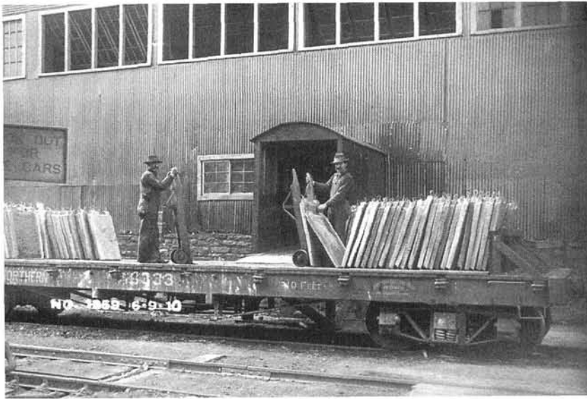
Figure 2. It may often be more typical for industrial archeologists and other scholars to investigate the loading dock, where raw materials are received and finished products shipped, than to attend to the outlets for wastes from industrial processes. Workers are shown here loading cast copper anodes onto a railroad car at the Anaconda Copper Mining Company's smelter at Great Falls, Montana, in the early 1900s.