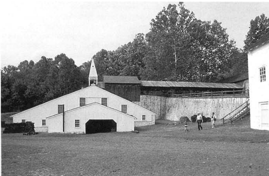
Figure 1. Although the blast furnace is a central feature at Hopewell furnace, an iron plantation in Pennsylvania, the National Park Service interprets more than just the metallurgical features at the site. The NPS also interprets the lives of workers and families who lived there and the ways those people managed resources on the plantation to insure a long-term supply of charcoal for the furnace, fodder for their livestock, and food for themselves.

We've been interested, for example, in the receiving dock, where raw materials arrived; in the parts of the plant where materials were processed; in the housing, where workers lived; and in the shipping dock, where finished products were sent to market; but we may have paid little attention to the back door where wastes were thrown out. If we've recorded the back door as an exit point for byproducts, how far have we looked beyond it to see where those wastes have fallen? Who has had to bear the brunt of those wastes falling where they have? Did the industry in question manage the wastes in any way after they were discharged? How have the waste deposits changed over time?