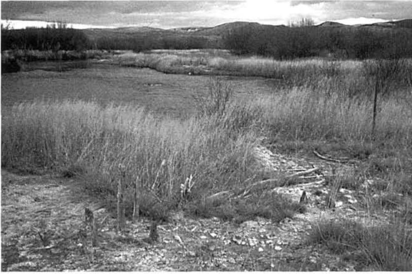
Figure 8. Tailings washed downstream from Butte and Anaconda are still visible along the Clark Fork River 80 years after the Anaconda Copper Mining Company built the Warm Springs ponds, engineered to prevent tailings from flowing downstream of the ponds. Tailings on the Grant Kohrs Ranch are visible in this photograph as patches of ground without vegetation.