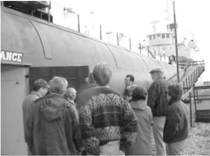
SIAers at the whaleback freighter S. S. Meteor.

dio where the artist described the process of creating raku pottery.