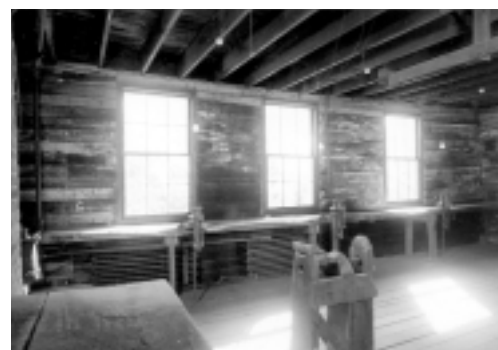
Interior of the Bench Shop, before (top) and after (bottom) restoration.