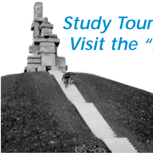
Imaginative sculpture made of recycled industrial building foundations, erected on coalmine waste tip near Gilsenkirchen.