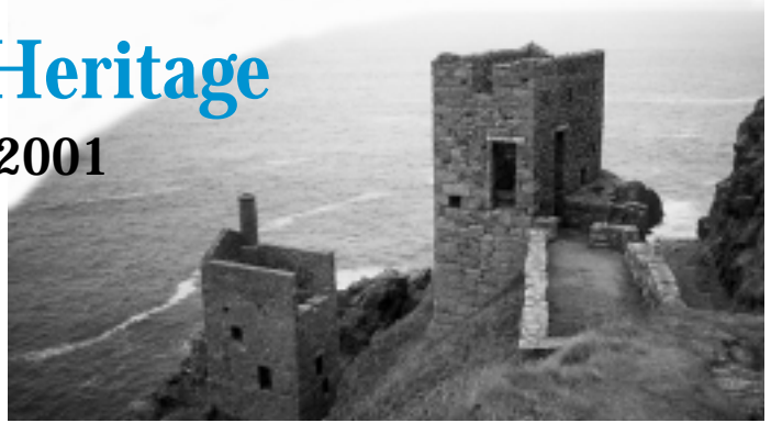
Stone engine houses perch on the Cornish coast at Botallack in the St. Just mining district where tin mines stretched under the sea.

On the study tour's itinerary are the Blue Hills Tin Streams , a knock-your-socks off site with working ore stamps, ball mill, buddle, and shaker table, all powered by water from a hillside leat, or raceway. They are streaming waste sands from several hundred years of working alluvial sands. At the King Edward Mine , participants will see an extensive collection of historic surface equipment, including a grizzly, a set of Cornish stamps (round head), and a set of California stamps (square head), a Cornish round frame, knockers, and buddles. Geevor Mine worked up until the late 1980s, when it was converted to a museum. There will be a short underground tour and lots of time to explore above ground.