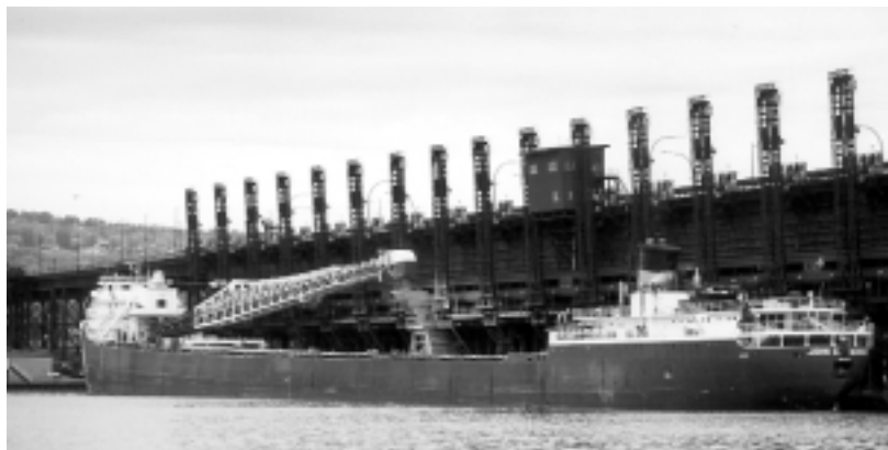
The John G. Munston unloads limestone (to be mixed with taconite for flux at pelletizing plants) before taking on iron at Duluth-Superior Harbor.

From Grand Rapids, Tour 2 headed east into the Mesabi Range to the open-pit Hill Annex Mine , which operated from 1913 to 1978 when the high-grade ore played out. It was sold to the Iron Range Resources and Rehabilitation Board for $1. The Board established a visitor center and gave tours of the mine for ten years before turning it over to the state for a park in 1988. Last stop of the day for this tour was the open-pit mine of the National Steel Pellet Co. , with its massive shovels and trucks. Also scheduled was a visit to the taconite plant, but unfortunately the group was running late and that part of the tour was canceled. Several SIAers reportedly wandered off to take pictures and explore, causing part of the delay. Shame! The taconite plant, built in 1967,