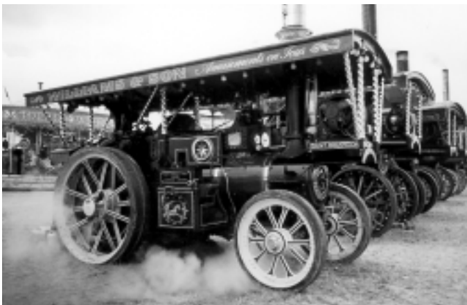
Fifty showmen's engines generate electricity at the Great Dorset Steam Fair, although the carousel in the background has its own steam engine in the center. The world's largest showing of engines, which attracts over 200 working steam engines, is held on a 500-acre site.