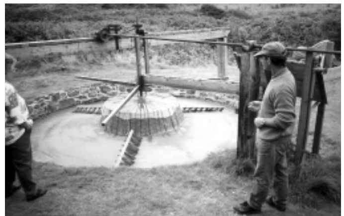
Colin Wills describes the operation of his convex buddle at the Blue Hills Tin Streams, where alluvial sand is still processed by historic methods in a working museum environment.