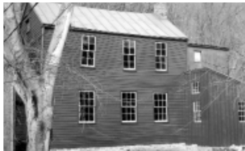
Bench and Blacksmith Shop, before (top) and after (bottom) restoration.