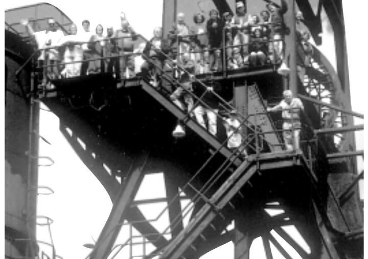
SIAers array themselves on the steel headframe of the Pioneer Mine, Ely.

The second of Thursday's tours visited the waterfront in downtown Duluth. The area has been redeveloped as a convention and retail center with lakefront park. A pedestrian walkway features outdoor sculpture, the focus of a walking tour that began with a slide show at the hotel and ended with a stop at a ceramicist's stu-