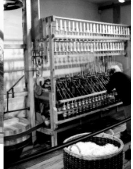
Exact replica of Arkwright's spinning machine at Cromford, near Ratingen, established in 1783 and thus Europe's first factory.