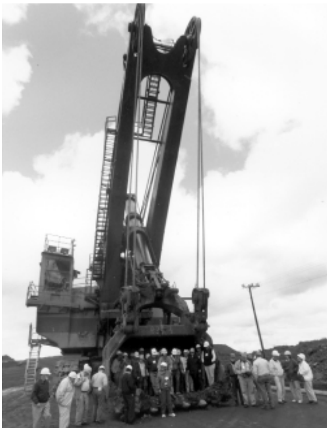
SIA members in the 33 cubic-yard bucket of a shovel, LTV taconite mine, Hoyt Lakes.