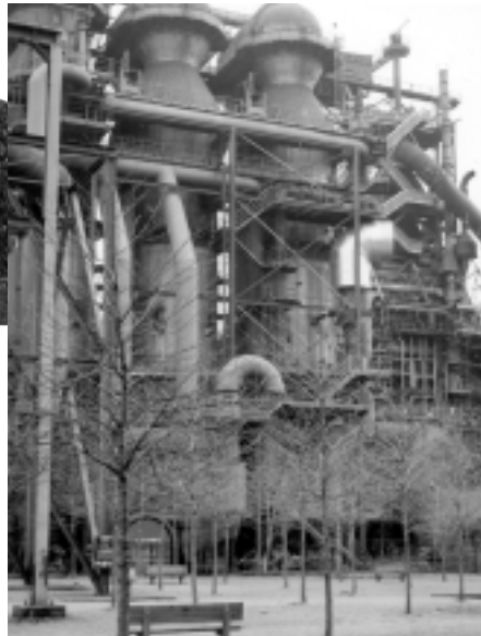
Massive blast furnace complex converted to public landscape park over 6 kilometers in length.