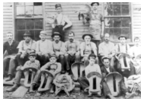
Schroeder workers and saddletrees, ca. 1880.