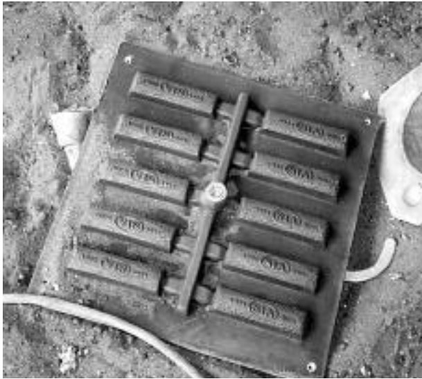
The pattern for the SIA 30th anniversary pigs, Sloss Furnaces NHL.