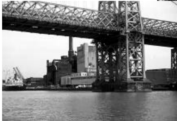
View under the Williamsburg Bridge and in the background the Domino Sugar refinery. The refinery is a possible tour stop of the 2002 Annual Conference.

M ark your calendars! The Roebling Chapter is hard at work finalizing arrangements for the SIA's 31st Annual Conference in Brooklyn, NY, June 6-9. Tours will explore Brooklyn's prominence as a transportation center and the many manufacturers and processing plants that support the great metropolis to Brooklyn's west. Themes for the tentatively scheduled Friday tours include steam plants; food processing (ethnic delights such as tortillas, bialys, and matzos); the "death" industry (Greenwood cemetery, casket manufacturing, and monument cutting), and those famous bridges (the Brooklyn Bridge, the earliest extant concrete bridge in America, and the Triborough Bridge). Possible pre- and post-conference tours will highlight parks and parkways in Brooklyn and Manhattan (the legacy of Robert Moses) and the Steinway piano factory. And yes, Coney Island and a boat tour of the East River are among the sites under consideration. The conference hotel will be the Marriott in downtown Brooklyn. Registration materials will be mailed to all SIA members in early spring. General info: Mary Habstritt, (212) 769-4946; mhabstritt@aol.com .