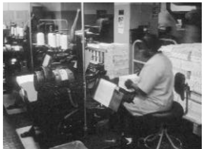
A worker prepares to sew signatures at the Government Printing Office.