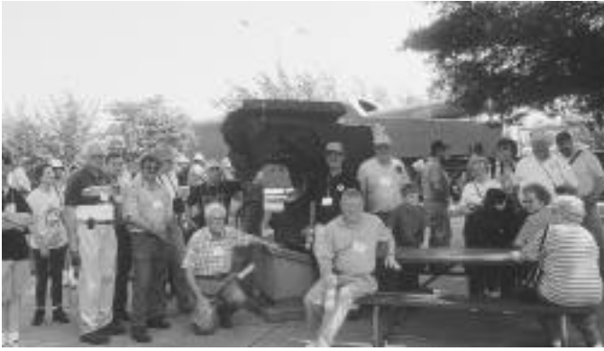
SIA group poses beside an armor plate segment at the Washington Navy Yard. The 660 mm (26-in.) Japanese plate was tested after WW II with an armor-piercing round that cleanly holed the sample, cratering and peeling the steel's foliated structure as if pastry.

Established in 1800, the yard has served a variety of purposes over the years including shipbuilding, the development and manufacture of shipboard equipment, and naval research. Prior to the Civil War, Lt. John A. Dahlgren established a gun foundry here, designated the Naval Gun Factory in 1884, and most of the large brick buildings were constructed for this role. The yard also houses the Naval Museum, which unfortunately was closed for restoration.