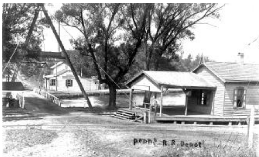
Delaware & Raritan Canal State Park

Looking for a genuine wood flag pole up to 40-ft. or a bit more - or the means to turn the like? Go to Hennessy House (Box 57, Sierra City, CA 96125, Attn: Tom Hennessy; 1-800-285-2122), which since 1985 has been producing these on a custom-built milling lathe derived from the wood mast industry. Machinery and products can be seen on their Web site: www.woodenflagpoles.com . ■