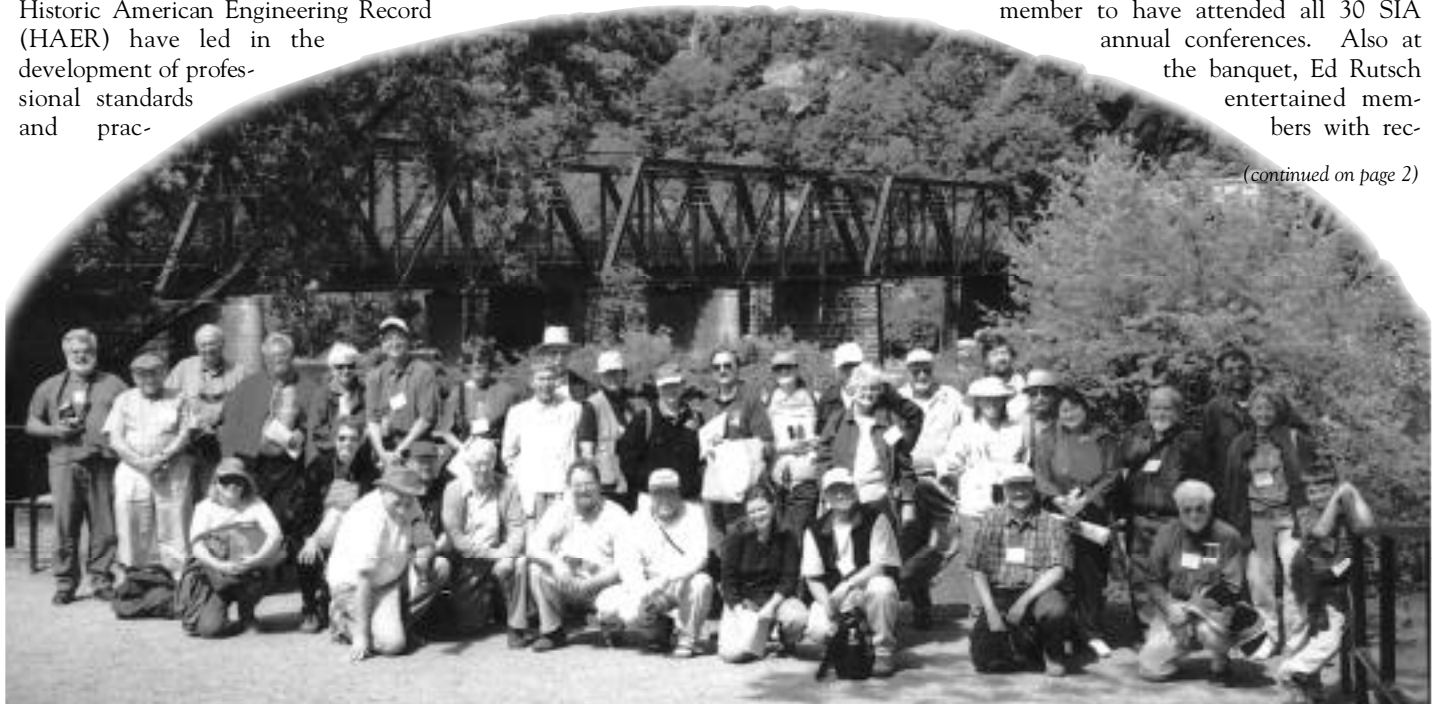
Tour group at "The Point" in Harpers Ferry with B&O RR bridges in the background.