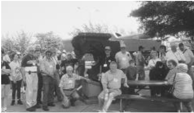
SIA group poses beside an armor plate segment at the Washington Navy Yard. The 660 mm (26-in.) Japanese plate was tested after WW II with an armor-piercing round that cleanly holed the sample, cratering and peeling the steel's foliated structure as if pastry.