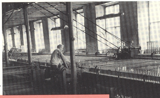
Platt Brothers mules of 1873 in operation at the Dangerfield Mill in Hawick.

Day 1: Forty-three SIA members met at the Roxburghe Hotel on historic Charlotte Square (designed by Robert Adam 1792, completed 1820) in the New Town of Edinburgh. Our first event was a ferry boat tour of the Firth of Forth, starting