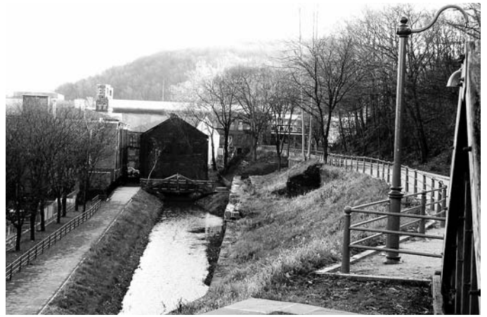
Paterson's Upper Raceway Park with the Rogers Locomotive Works in the background.