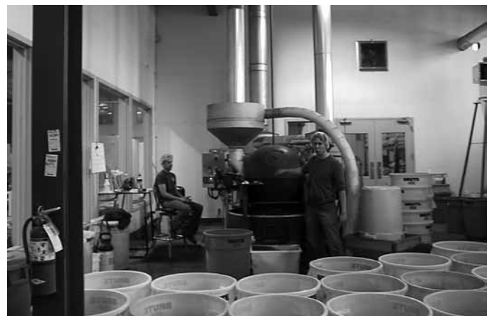
The chocolate mill at Theo Chocolate.