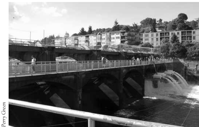
Hiram M. Chittenden Locks.