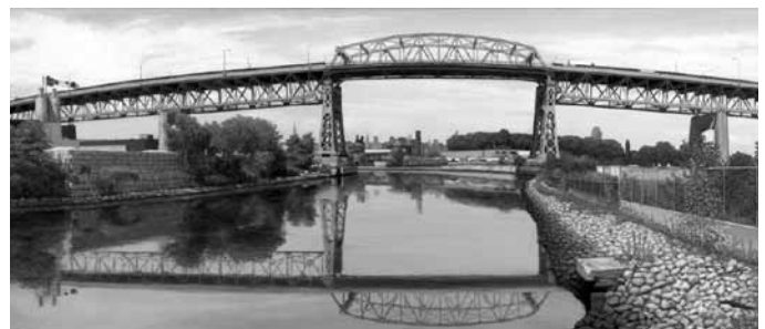
Valeri Larko, Kosciuszko Bridge , 2009, oil/linen, 25" × 60", Private Collection.