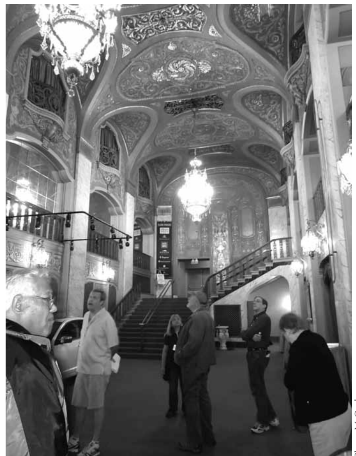
The Paramount Theater lobby.

As the heart of the city moved north following the Klondike Gold Rush, Skid Road became Skid Row. Preservationists grouped in the late 1960s to save the area's beautiful Victorian and Edwardian Era architecture from demolition. The cobblestone streets and horse-drawn carriages remind visitors of Victorian Era city life. The tour visited Pioneer Place at the corner of St. James and First Avenues. The iron pergola was built as a streetcar passenger shelter for the 1909 World's Fair set on what is now the campus of the University of Washington. A Tlingit totem pole is also there. Other totem poles are located in and around Occidental Park.