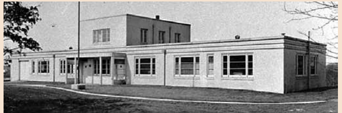
Preston Lab, c. 1940s.