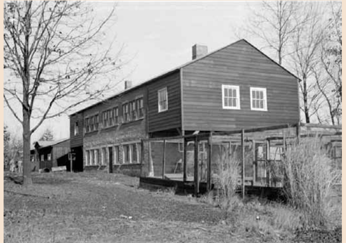
The instrument building at Preston Lab, c. 1940s. In the foreground are bird cages that Preston kept for his ornithology work.

Long-term preservation research and planning have been on-going for six months. There is an archive of nine linear ft. of papers on all topics relating to Preston and some 900 black-and-white photo negatives, all from the 1930s and 1940s, as well as other materials and the site itself. The lab now feels it would be valuable to have outside experts to review the project and offer some credibility with the township. For those involved, it is time to pause and ask for a fresh perspective. The consultation would need to be undertaken as a professional courtesy in these cash-strapped times. Researchers who wish to use the archives are welcome. Info: Mike Gimigliano, mgeca@zoominternet.net .