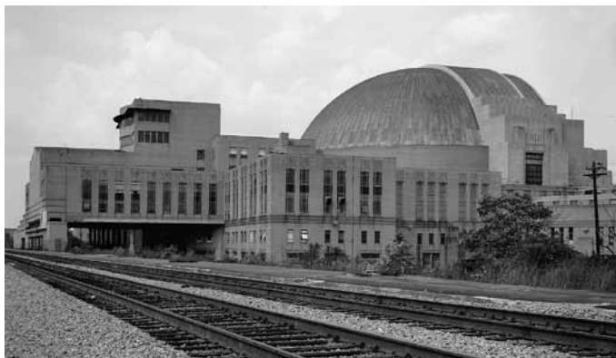
HABS OH-705 (July 1981)