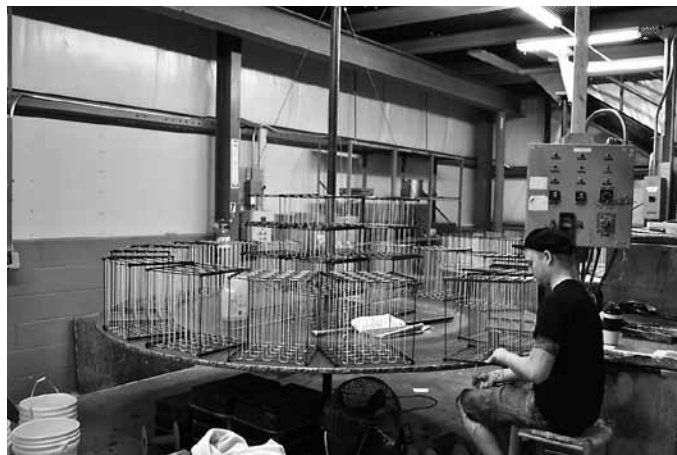
A worker strings the wicks on candle-dipping frames at Mole Hollow Candles.

Next on the tour were two old-line machine tool and machinery component manufacturers typical of those that