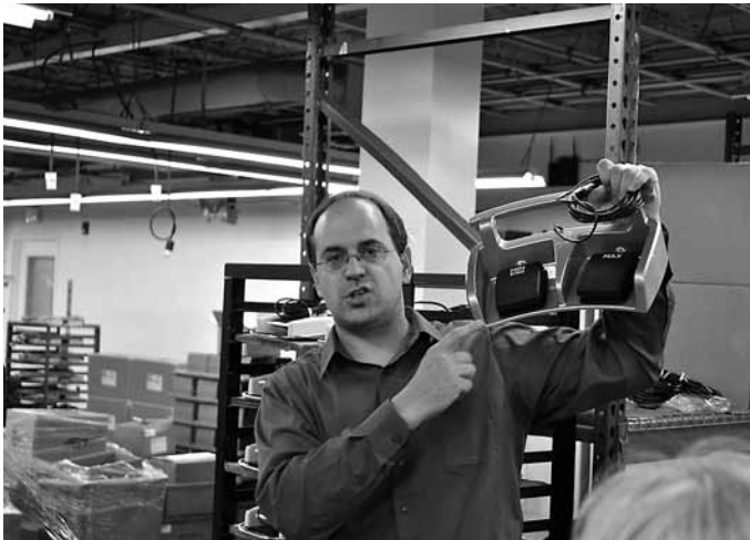
A manager at Linemaster Switch displays a foot switch.

tion bakery operated by Automatic Rolls of New England in Daysville, Conn. The bakery floor is a state-of-the-art, Rube Goldberg-esque operation of conveyors, elevators and spiral chutes where little is done by hand in order to ensure speed and the highest of sanitary conditions. Prior to entering, we were required to don paper hats and booties and remove all jewelry in order that no contaminants enter the dough. The bakery produces 6,000 dozen buns per day, most of them destined for McDonald's restaurants located throughout the Northeast. It also produces english muffins. Of course, at one level, the process is no more complex than baking at home. It follows the simple steps of measuring ingredients, mixing them, proofing the dough, baking the dough, and finally packaging, but everything at Automatic Rolls is done precisely and in huge quantities, with an amazing amount of quality control and testing to deliver a consistent and predictable product.