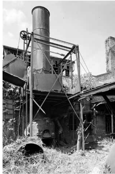
The cupola furnace at the Appomattox Iron Works, Petersburg, Va.

Minnesota's 2011 Ten Most Endangered List includes four IA sites. Industrial sites are often found at the fringes of the mainstream of the historic preservation movement, so this in itself is noteworthy and an indication of the growing interest in industrial heritage. The most significant of the sites on the list is the Pillsbury A Mill (tour site—1983 SIA Annual Conference, Minneapolis). The flour mill, which when completed in 1881 was the largest and most advanced in the world, is a National Historic Landmark that until recently appeared to have a bright future as part of a creative redevelopment plan for St. Anthony Falls. Financing fell through last year, and now the future of the complex is in question. Other IA sites on the list are the dredge William A. Thompson , the Mitchell Yards of the Duluth Missabe & Northern RR in Hibbing (combined with other entities in 1937-38 to form the Duluth, Missabe & Iron Range), and the Jackson Street Water Tower in Elk River.