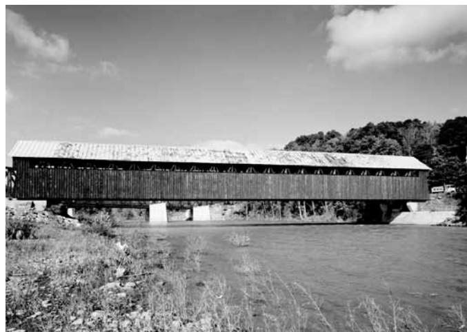
HAER NY-331 (2004)