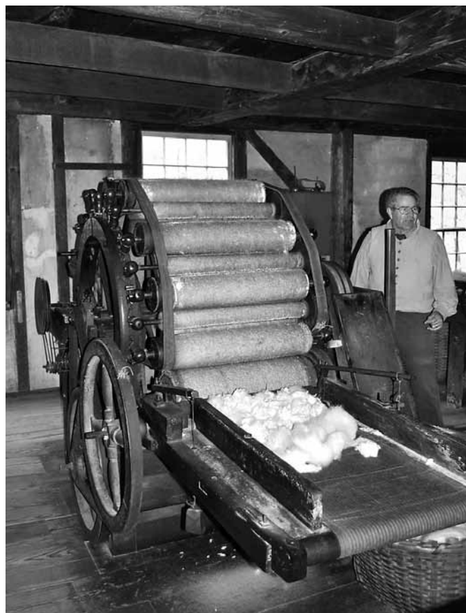
Inside the village carding mill at Old Sturbridge Village.