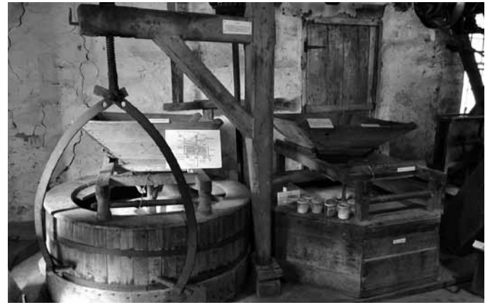
Two runs of stone and crane inside the Gurleysville Grist Mill.

mill villages. Lunch was had outdoors in Mansfield adjacent to the Kirby Mill , a handsome stone textile mill built in 1882, and the Mansfield Hollow Dam , a U.S. Army Corps of Engineers project completed in 1952. In Willimantic, we were met by volunteers and staff of the Windham Textile & History Museum , located in the building constructed in 1877 as a company store by the Willimantic Linen Co. It features exhibits on the history of the industry with a special emphasis on workers' lives. Exploration of the museum was followed by an outdoor walking tour of the Willimantic Linen Co. site. The mill complex consists of impressive multi-story factories, most of them of stone with slow-burning timber floor construction dating from the mid-1860s to mid-1890s. The company made sewing threads, catering to the vast market created by sewing machines. In 1895, American Thread purchased it. The mills closed in 1985, a major blow to the local economy. Since then, several of the buildings have been rehabilitated for use as residential condominiums.