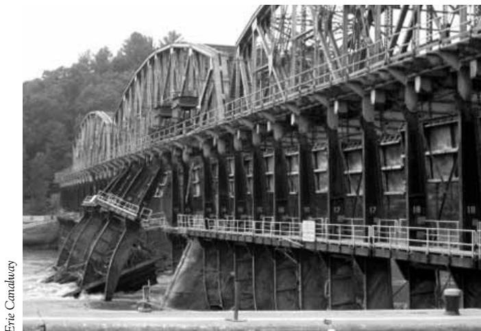
Steel uprights at Lock 11 on the N.Y. State Barge Canal were forced out of position by rushing water and debris.

The devastation caused by the storms is a reminder of the importance of disaster preparedness for all of those who care about historic sites. A good checklist can be found at www.preservationnation.org/resources/technical-assistance/disaster-recovery/ . ■