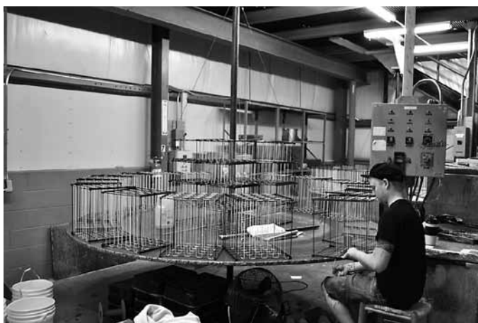
A worker strings the wicks on candle-dipping frames at Mole Hollow Candles.

Saturday's tours ranged down, across, and back up the Last Green Valley from Southbridge as far south as Willimantic with windshield tours and photo opportunities of several