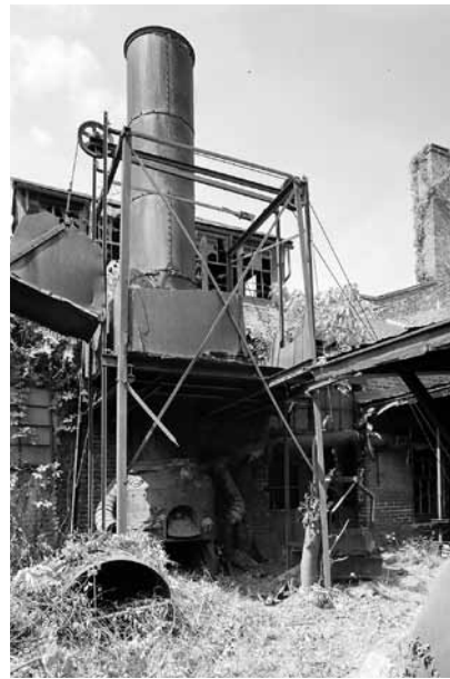
The cupola furnace at the Appomattox Iron Works, Petersburg, Va.

Minnesota's 2011 Ten Most Endangered List includes four IA sites. Industrial sites are often found at the fringes of the mainstream of the historic preservation movement, so this in itself is noteworthy and an indication of the growing interest in industrial heritage. The most significant of the sites on the list is the Pillsbury A Mill (tour site—1983 SIA Annual Conference, Minneapolis). The flour mill, which when completed in 1881 was the largest and most advanced in the world, is a National Historic Landmark that until recently appeared to have a bright future as part of a creative redevelopment plan for St. Anthony Falls. Financing fell through last year, and now the future of the complex is in question. Other IA sites on the list are the dredge William A. Thompson , the Mitchell Yards of the Duluth Missabe & Northern RR in Hibbing (combined with other entities in 1937-38 to form the Duluth, Missabe & Iron Range), and the Jackson Street Water Tower in Elk River.