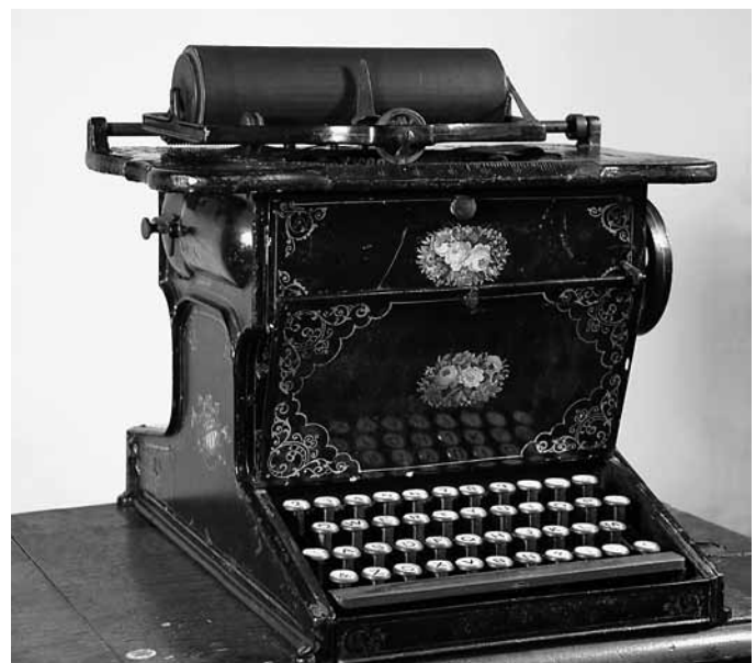
The Sholes & Glidden Typewriter, on display at the Milwaukee Public Library.