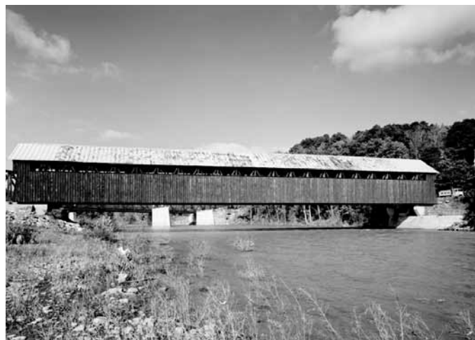
Flooding related to Hurricane Irene and Tropical Storm Lee destroyed the Old Bleinheim Covered Bridge.