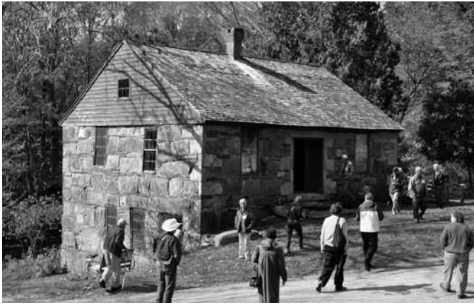
At the Gurleysville Grist Mill, SIA members enjoyed the intact 19th-century rural mill and a beautiful fall day.