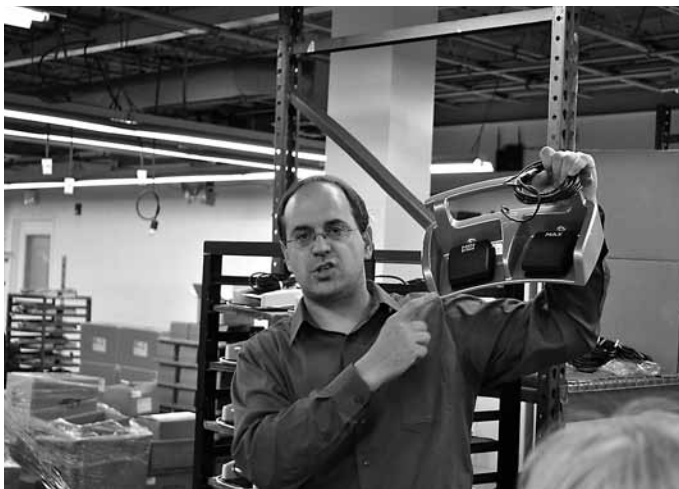
A manager at Linemaster Switch displays a foot switch.

tion bakery operated by Automatic Rolls of New England in Daysville, Conn. The bakery floor is a state-of-the-art, Rube Goldberg-esque operation of conveyors, elevators and spiral chutes where little is done by hand in order to ensure speed and the highest of sanitary conditions. Prior to entering, we were required to don paper hats and booties and remove all jewelry in order that no contaminants enter the dough. The bakery produces 6,000 dozen buns per day, most of them destined for McDonald's restaurants located throughout the Northeast. It also produces english muffins. Of course, at one level, the process is no more complex than baking at home. It follows the simple steps of measuring ingredients, mixing them, proofing the dough, baking the dough, and finally packaging, but everything at Automatic Rolls is done precisely and in huge quantities, with an amazing amount of quality control and testing to deliver a consistent and predictable product.