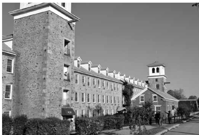
Wauregan Mill is typical of the many textile mills that can still be found in the Last Green Valley.