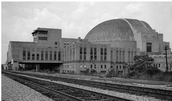
HABS OH-705 (July 1981)