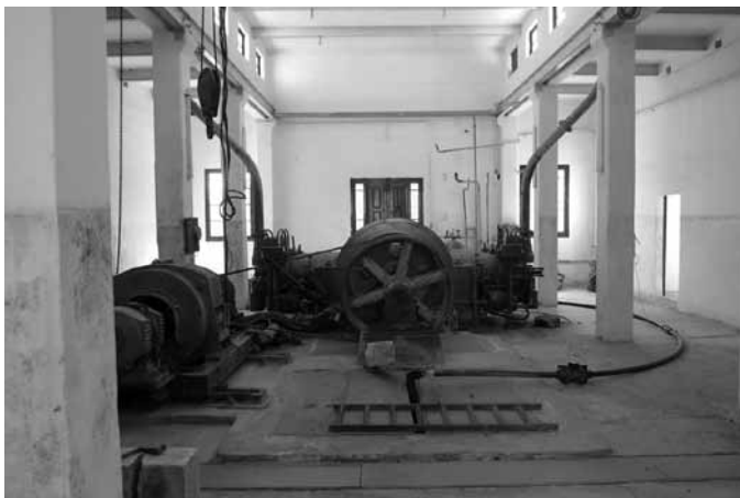
Volunteers recently restored to operating condition the engine at the 1935 Wied il-Ghasel pumping station.