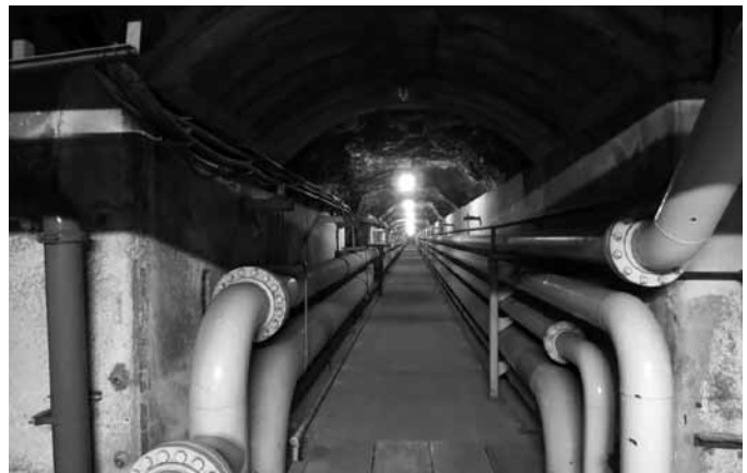
The cylindrical horizontal steel tanks at Has Saptan are connected to a series of underground tunnels housing the pipes connecting the tanks to Malta's ports.