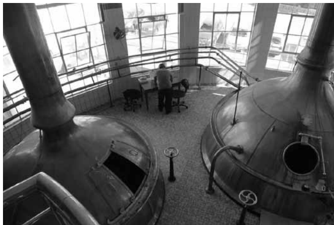
The copper brew kettles at Farsons Brewery.

was a secret site so its exhaust was vented out a long vertical shaft leading to the top of a hill.