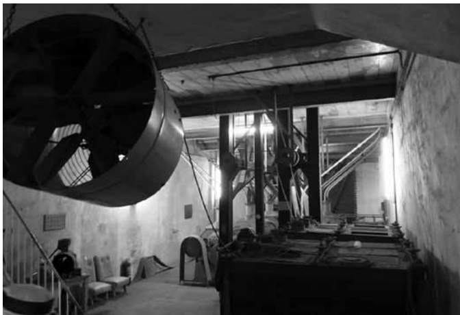
The Xemxija underground flour mill is one of eight such deeply buried mills built in the 1950s as part of improving Malta's ability to survive a war.

under high pressure, about 62 bar, and there is an energy recovery system using Pelton wheels (impulse water turbines) to recover this energy. The water makes its way to a central reservoir where it is blended with groundwater and finally treated with chlorine prior to distribution. Pembroke is one of three similar plants on the island; some hotels and businesses, such as Farsons (below), have private RO plants.