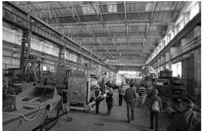
The Dockyard Boiler Shop is a steel-frame structure built by the British to replace an earlier stone shop destroyed during WWII. It now houses old buses and an assortment of machinery, most of it from the dockyards. Some day, some of these artifacts may find their way to display in a proposed industrial heritage museum.

Wednesday began with a cruise about the Grand Harbour , the largest natural harbor in the Mediterranean. We docked at Birgu, and then proceeded for a special visit to the home and offices of the Knights of St. John. This site is rarely open to tours, so we were honored to be admitted, and to enjoy the amazing views. The northeast side of the harbor is a series of deep inlets, so after lunch we made our way to the next inlet and the former Dockyard Boiler Shop , a cavernous building once used for the repair of the British navy's boilers. The shop is now being used to house a collection of large objects for a future National Industrial Heritage Museum . Two radial aircraft engines, salvaged from the sea and encrusted in calcium/salt deposits, were exemplary of the great deal of work that will be needed to prepare the objects for exhibition, but we all agreed that the boiler shop will make a very appropriate venue. We had a compressed visit to the National Maritime Museum , which traces Malta's maritime history from the 16th century when