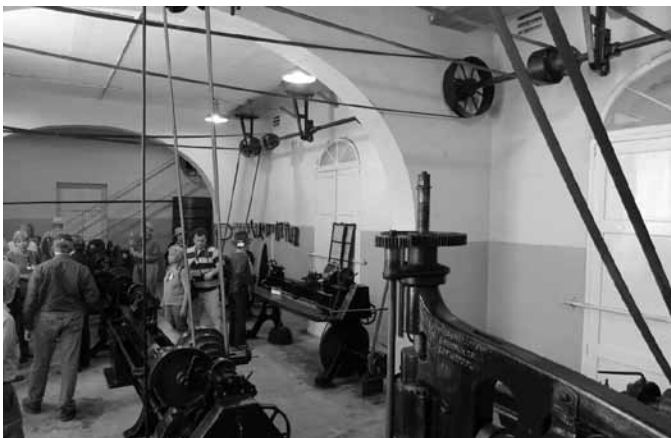
The workshops at the Vincenzo Bugeja Conservatory are complete to their original 1907 layout. The conservatory trained boys in the industrial arts.

Thursday's touring began with the Pembroke Reverse Osmosis (RO) Plant . RO of seawater supplies about 60% of Malta's potable water, the rest being groundwater or collected rainwater. About 54,000 cubic meters (14.3 million gallons) of seawater per day comes to the plant from wells at the edge of the sea. The primary filtration occurs in the porous rocks that the water must pass through even before it reaches the plant. At the RO Plant, pumps raise the pressure to 69 bar (about 1000 psi), and feed it into hundreds of seven-stage RO cartridges around 40 ft. long. The pressure drives fresh water through semipermeable membranes into a central collection tube, while increasingly salty residual water remains outside the tube. The residual water is still