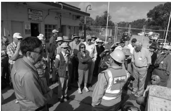
SIA's Malta Study Tour participants prepare to go underground at the Has Saptan underground fuel depot.