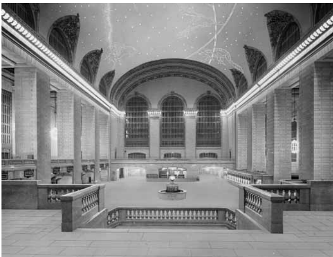
Main Concourse, Grand Central Terminal, ca. 1913.

The Metropolitan Transit Authority of New York (MTA) and Metro-North RR have announced plans for celebrating the 100th anniversary of Grand Central Terminal . The year-long celebration kicks off on Feb. 1, 2013 with a formal re-dedication ceremony and the opening of an exhibit in the terminal's Vanderbilt Hall. Other activities are to include publications, educational initiatives, exhibitions, a parade of historic trains, and collaborative events with heritage and arts organizations.— MTA Press Release (Feb. 2, 2012)