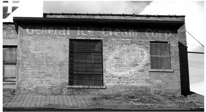
The General Ice Cream Co. creamery is slated to become the TechWorks! Museum in Binghamton, N.Y.

TechWorks! , a new museum of technology and industry, is in the planning stages in Binghamton, N.Y. The museum will be located in the former General Ice Cream Co. creamery, dating to the early 20th century. The site is a nexus of transportation with a railroad crossing the property, the Chenango River to the west, and Water Street to the east. Within view is the Marconi Tower, used in 1913 to send the first radio call to a moving train, proving that radio transmissions could be sent to a moving object. Just a short drive away is the company town of Endicott, which is named after Henry B. Endicott, the founder of the eponymous shoe company. Endicott was born of shoes, but it is perhaps best known as the "Birthplace of IBM." The Computing Tabulating Recording Co., the precursor to IBM, was founded in Endicott in 1911 based on the punch card tabulating technology developed by Herman Hollerith. A TechWorks! concept plan is currently being worked on by the Bucher/Borges Group (BBG), a consulting firm based in Easton, Md. The museum will emphasize green design and include engaging exhibits on the innovative processes of science, technology, engineering, and entrepreneurship.