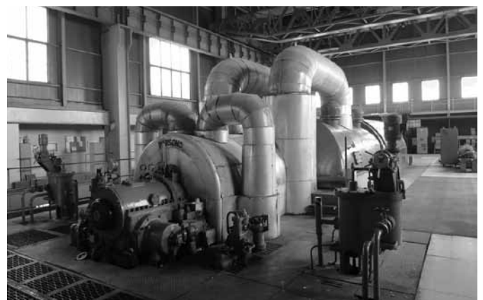
The Marsa Power Station was built in the 1950s with aid from the Marshall Plan.